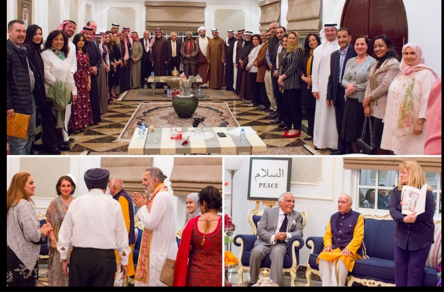
Building unity in the Middle East