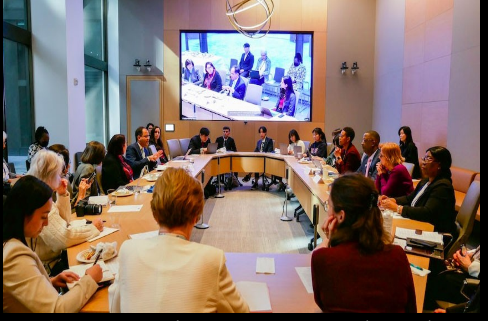
Bahá'í International Community, New York, future of work