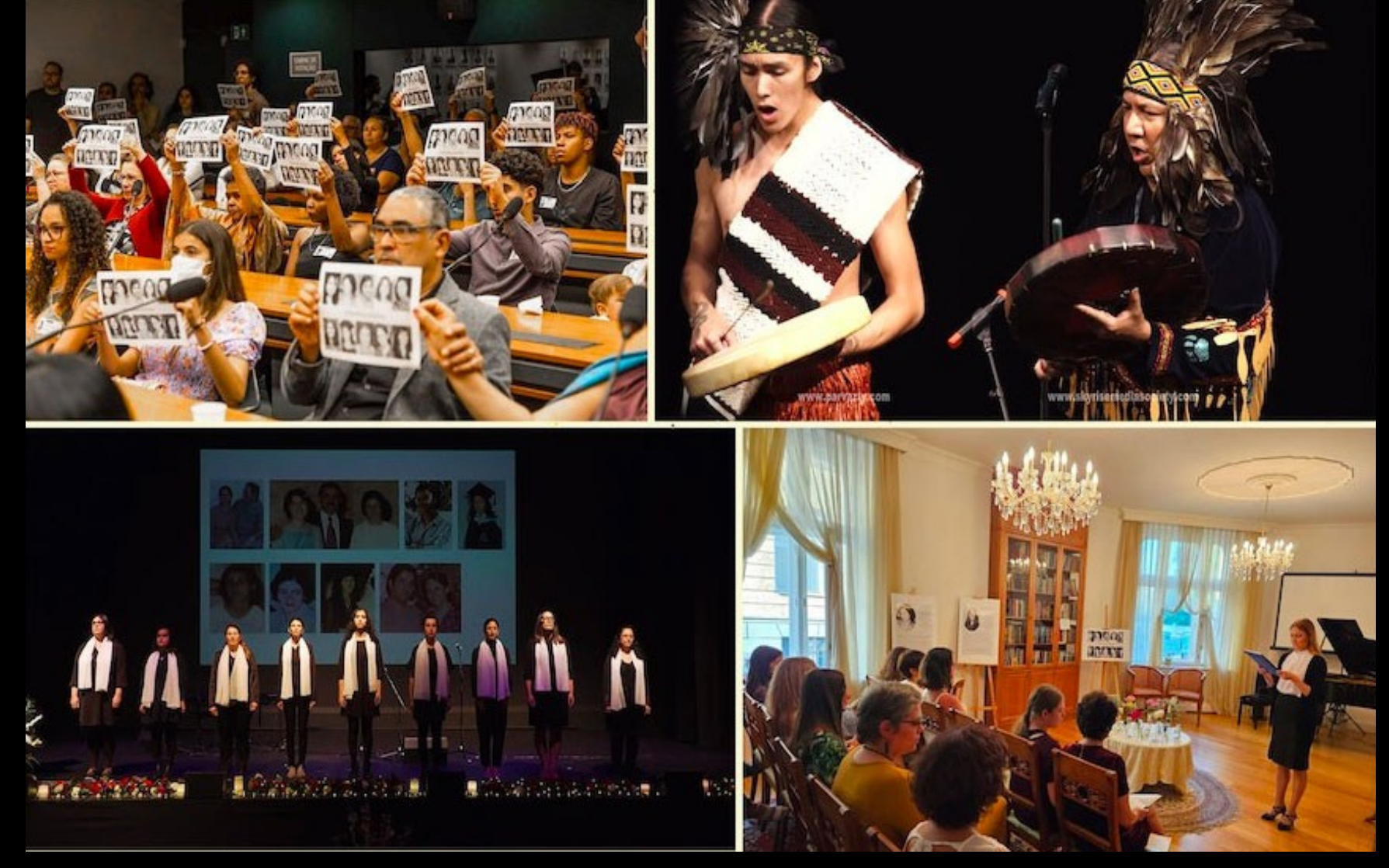
Our Story is One, commemorating women martyrs in Iran