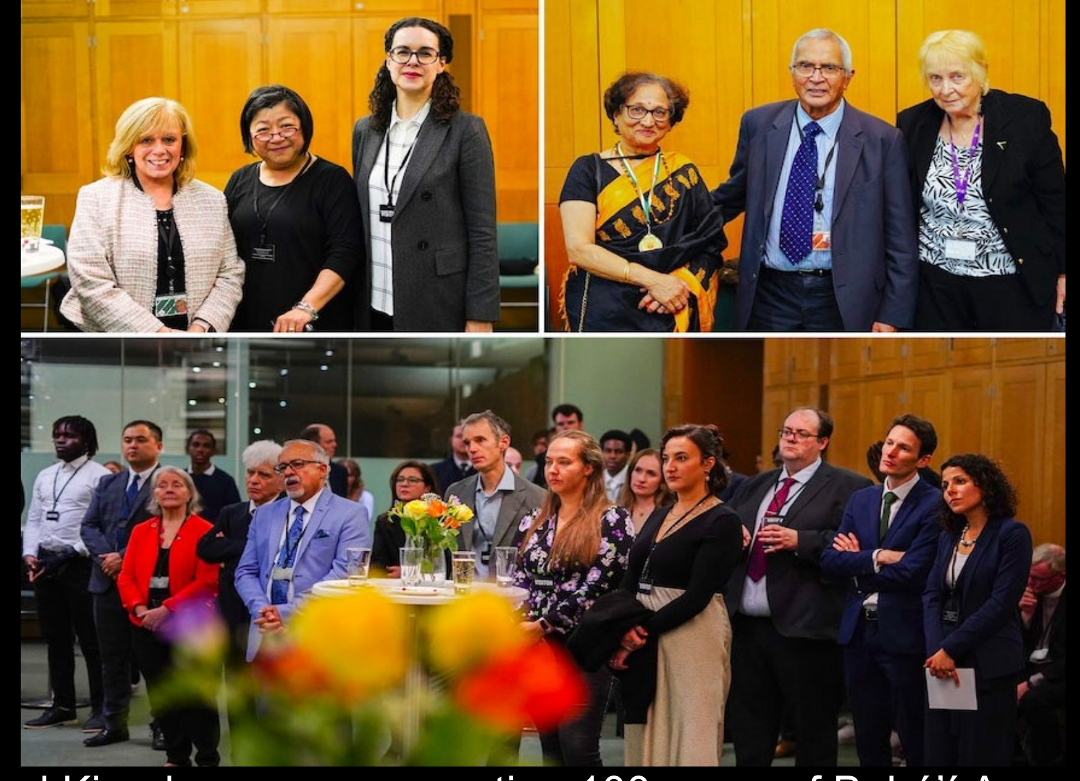
United Kingdom commemorating 100 years of Bahá'í Assembly