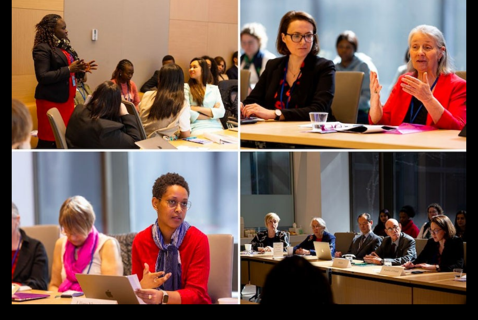
Bahá'í International Community, UN Commission on the Status of Women