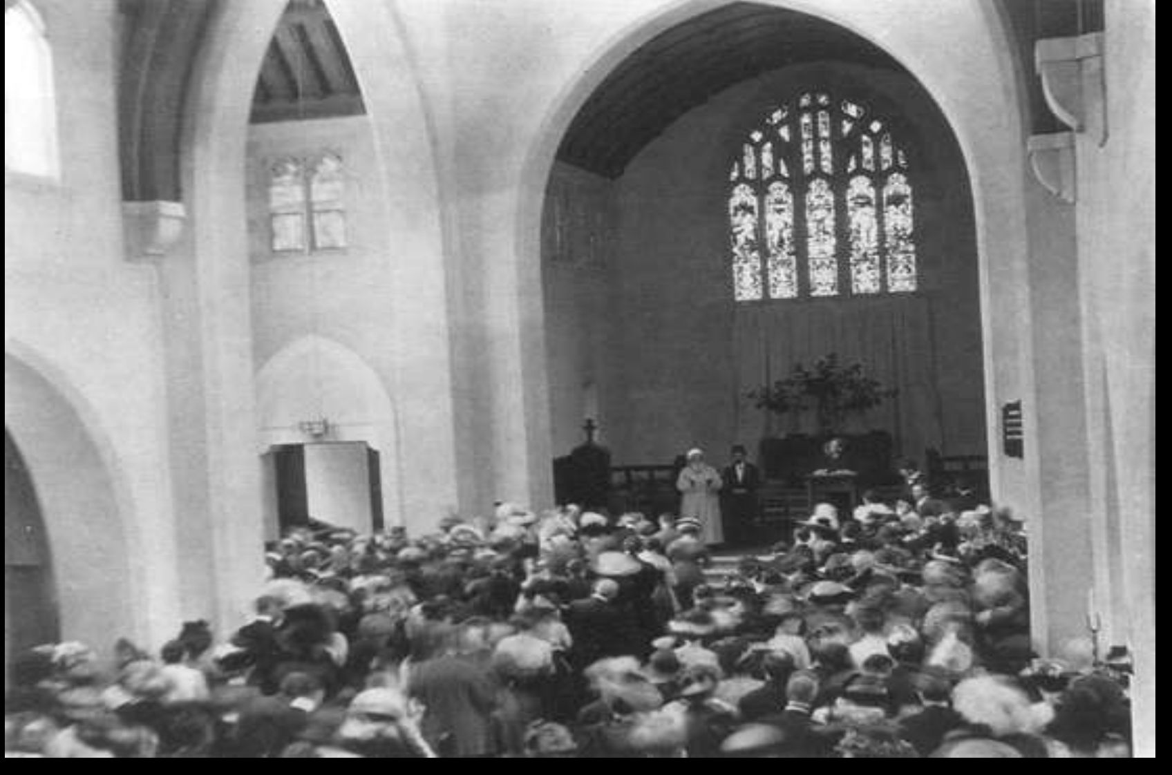
'Abdu'l-Bahá speaking in Chicago 1912