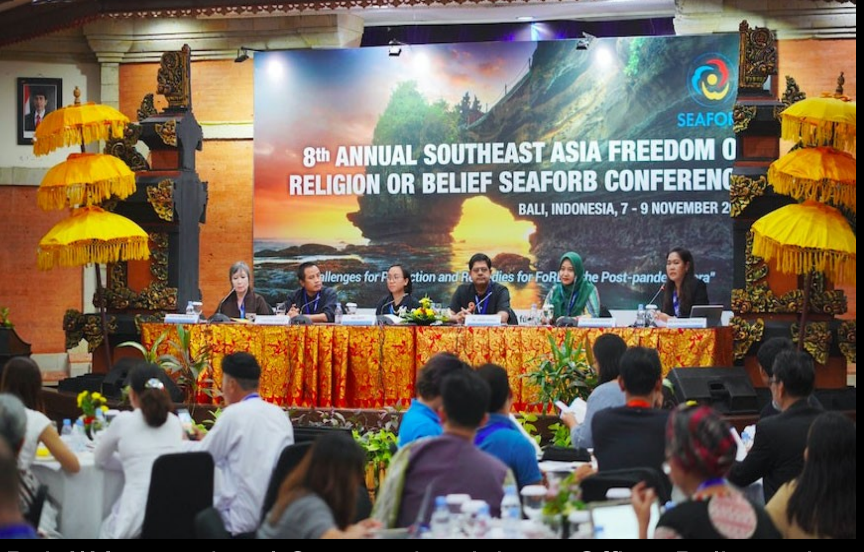
Bahá'í International Community, Jakarta Office, Bali meeting