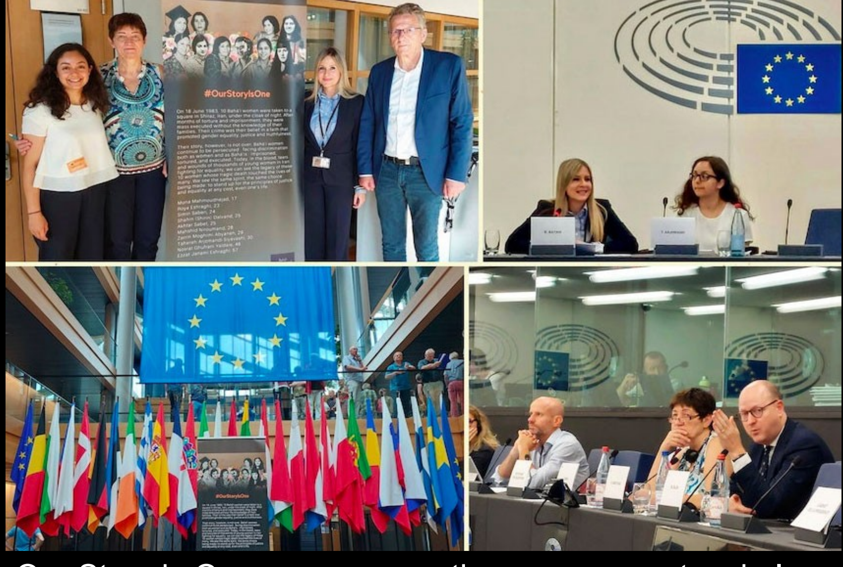
Our Story is One, commemorating women martyrs in Iran