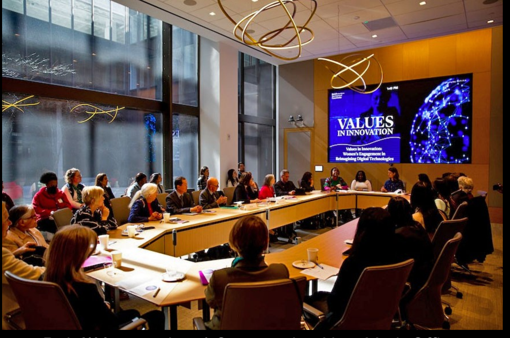
Bahá'í International Community, New York Office