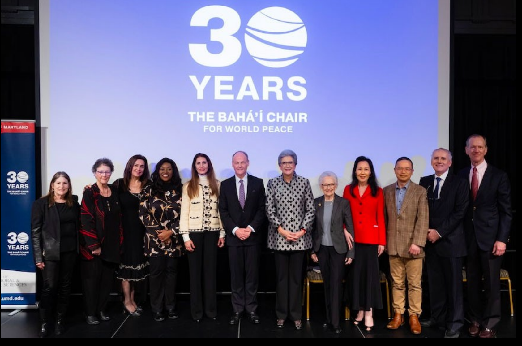
Bahá'í Chair for World Peace, University of Maryland, USA