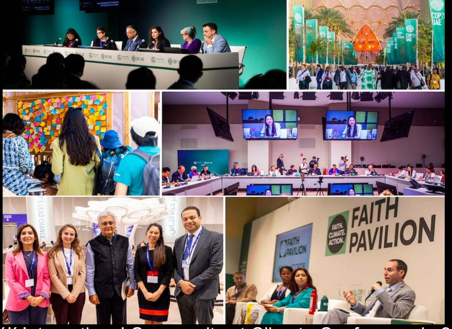
Bahá'í International Community at Climate Conference in 2023