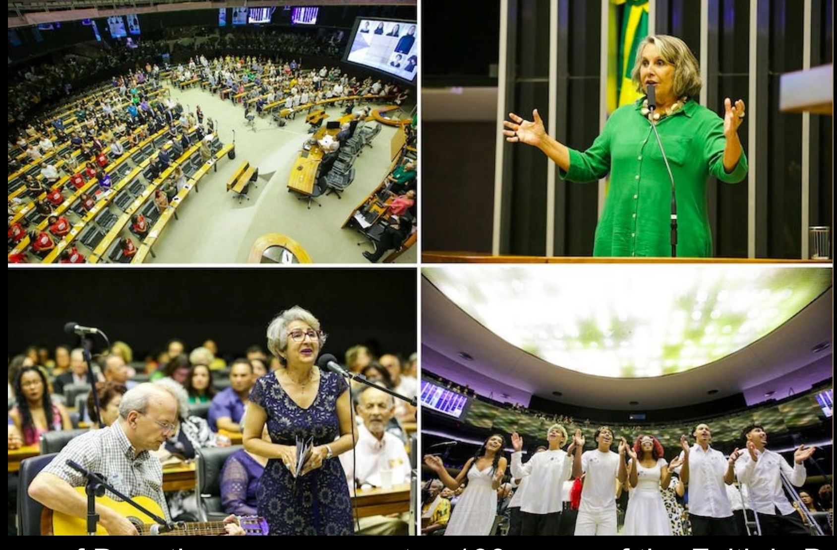
House of Deputies commemorates 100 years of the Faith in Brazil