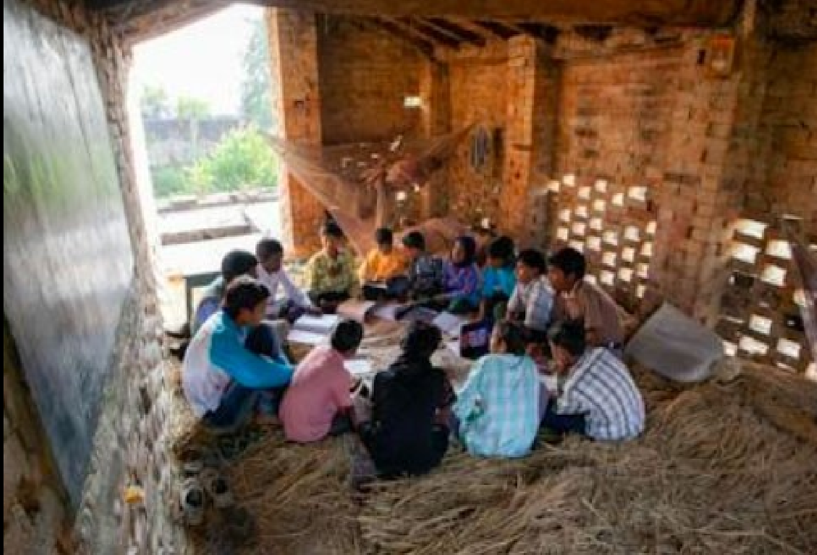
Junior youth in India