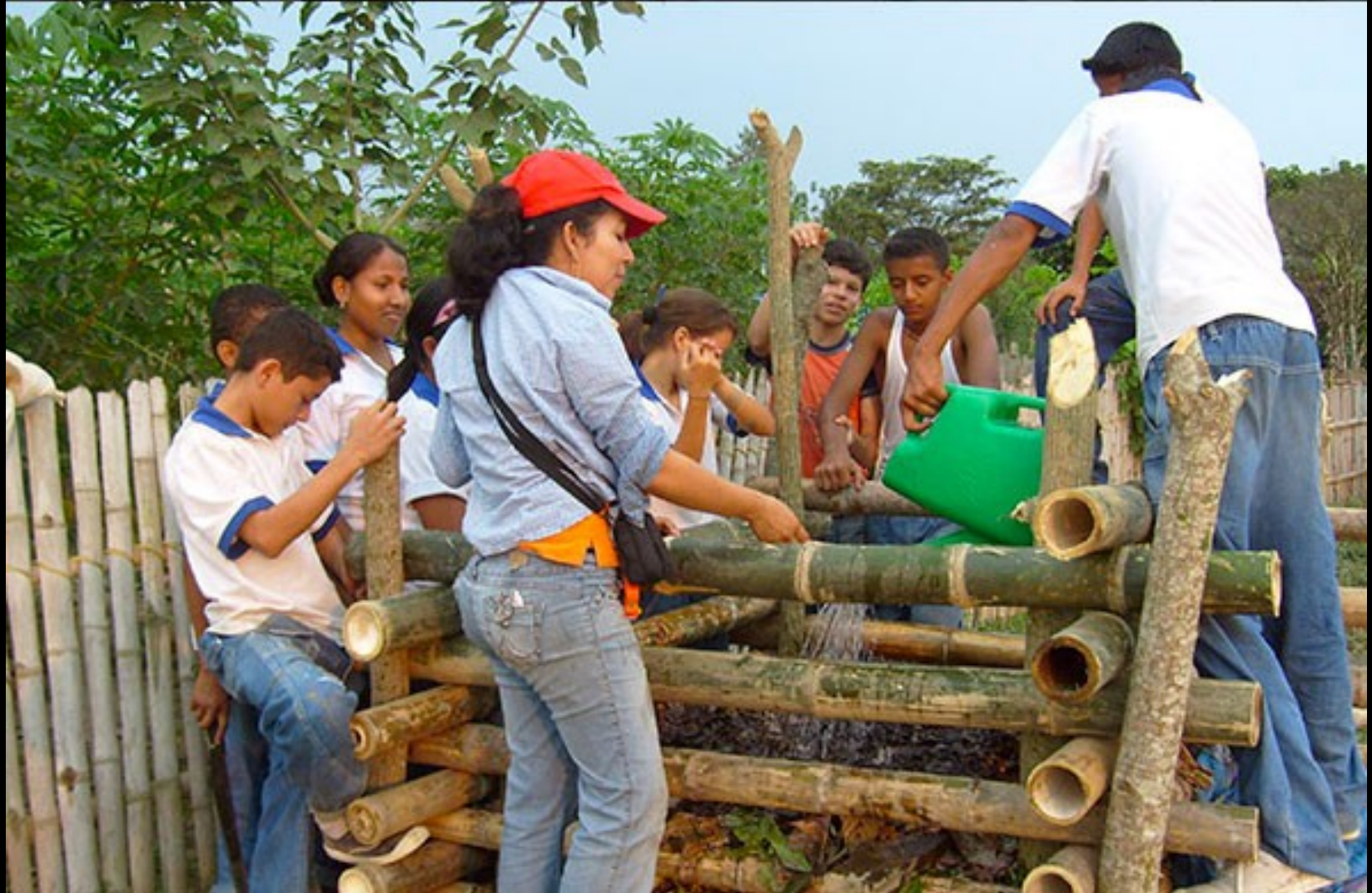
Junior youth service project building a compost bin