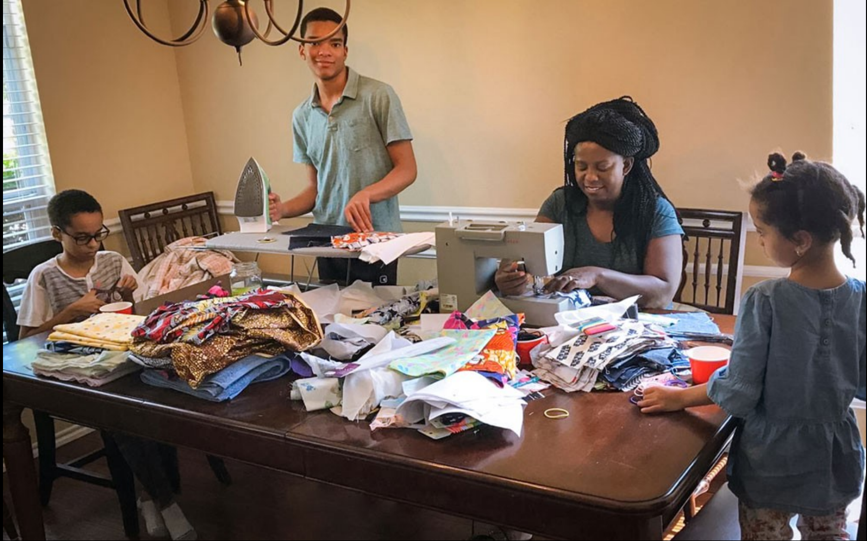
USA junior youth service project making face masks