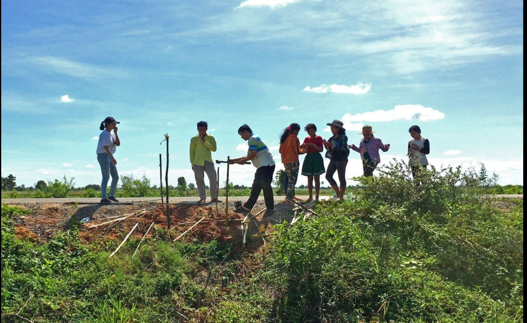
Cambodia junior youth planting trees for erosion control