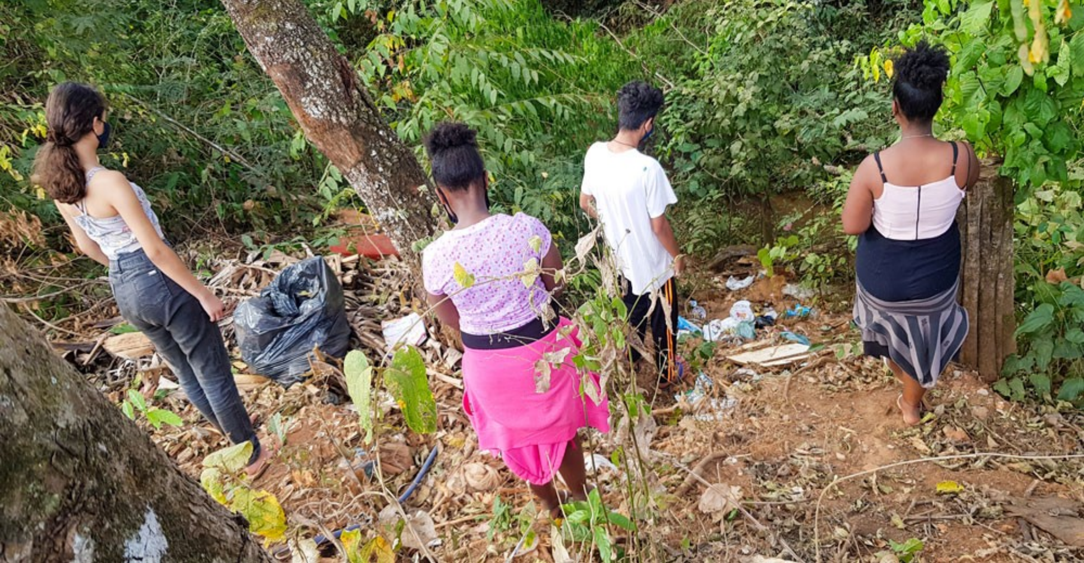
Brazil junior youth service project river cleanup