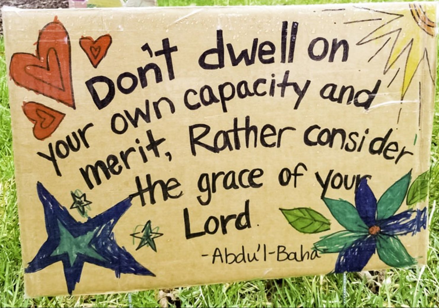
USA junior youth service project making signs