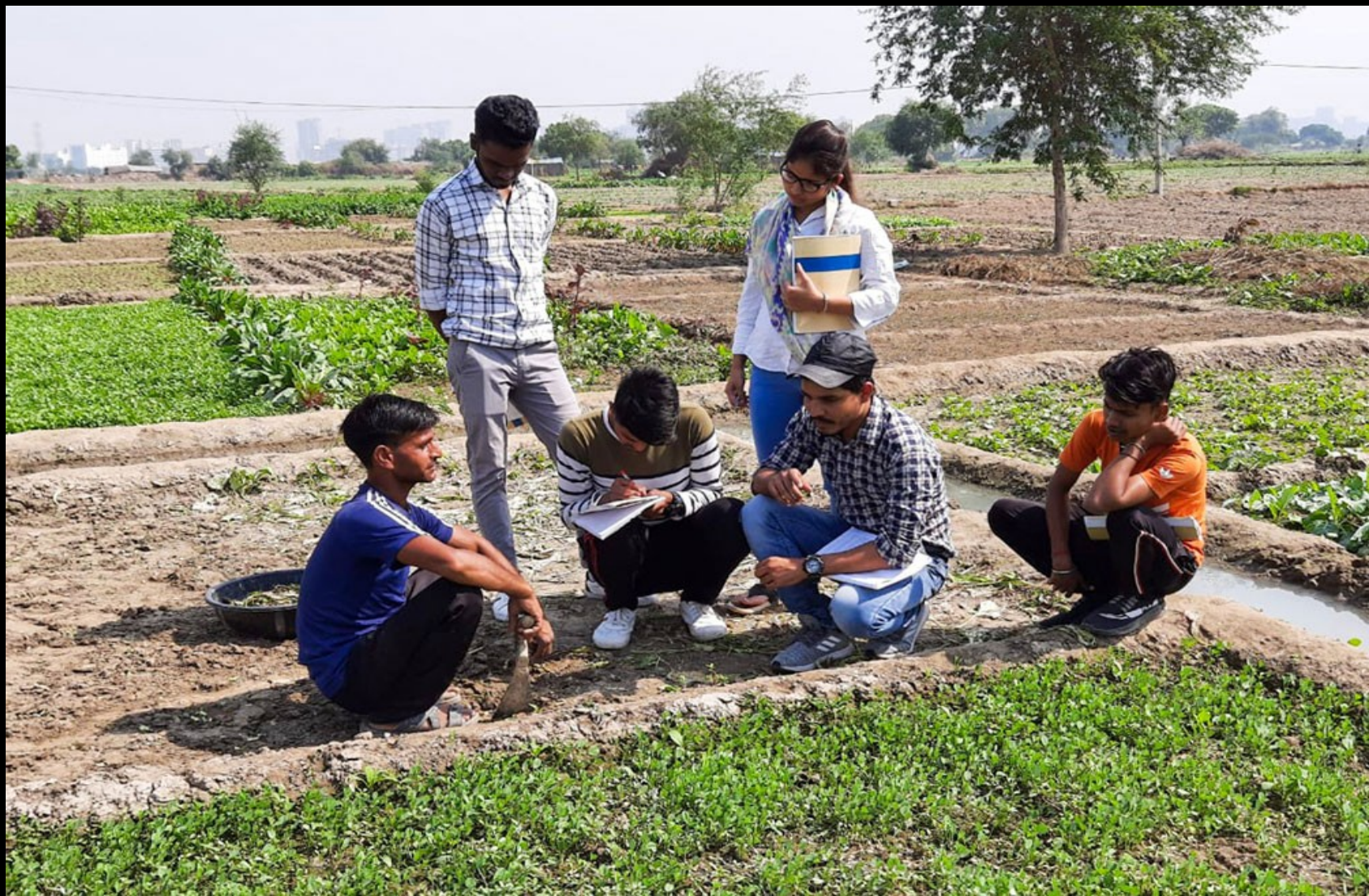
Junior youth service project in India