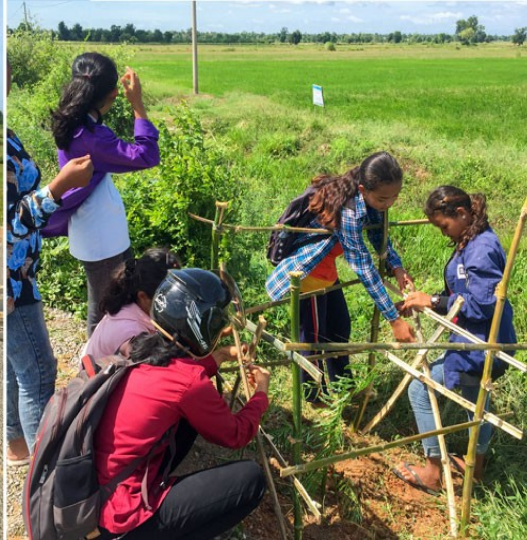
Cambodia junior youth planting trees for erosion control