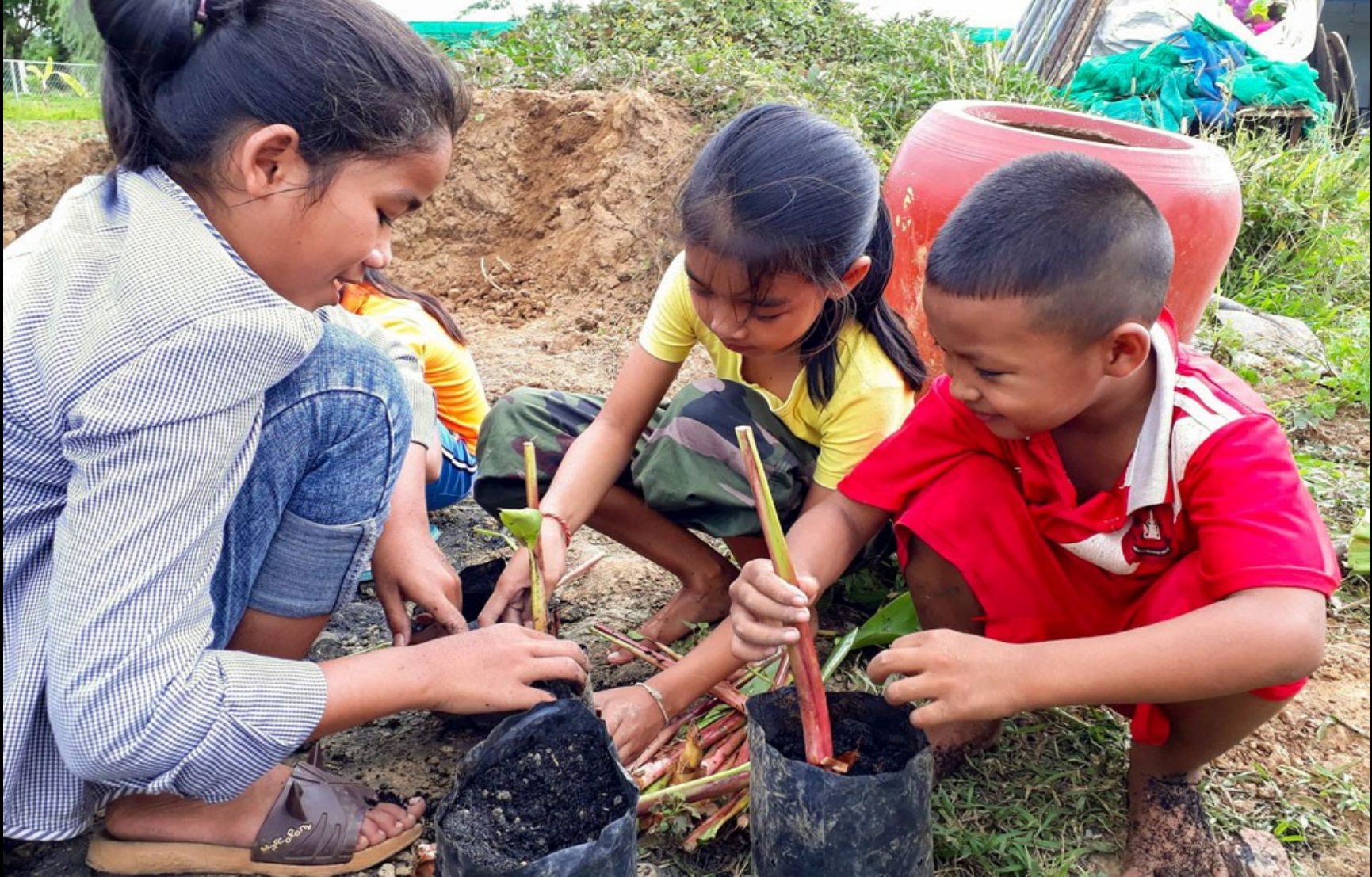
Cambodia - even the children helped with tree planting