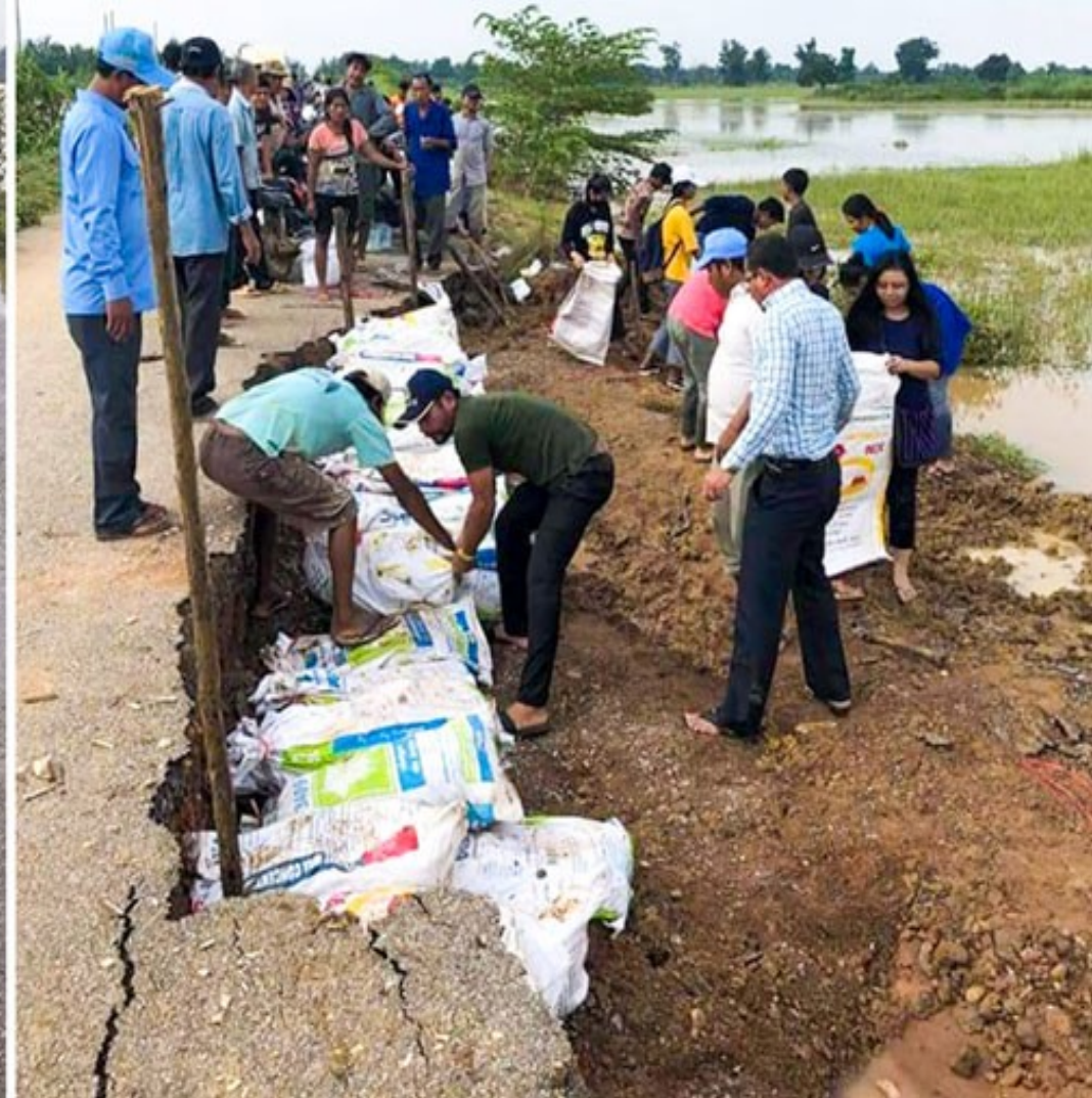
Cambodia flood damage where youth had not planted trees