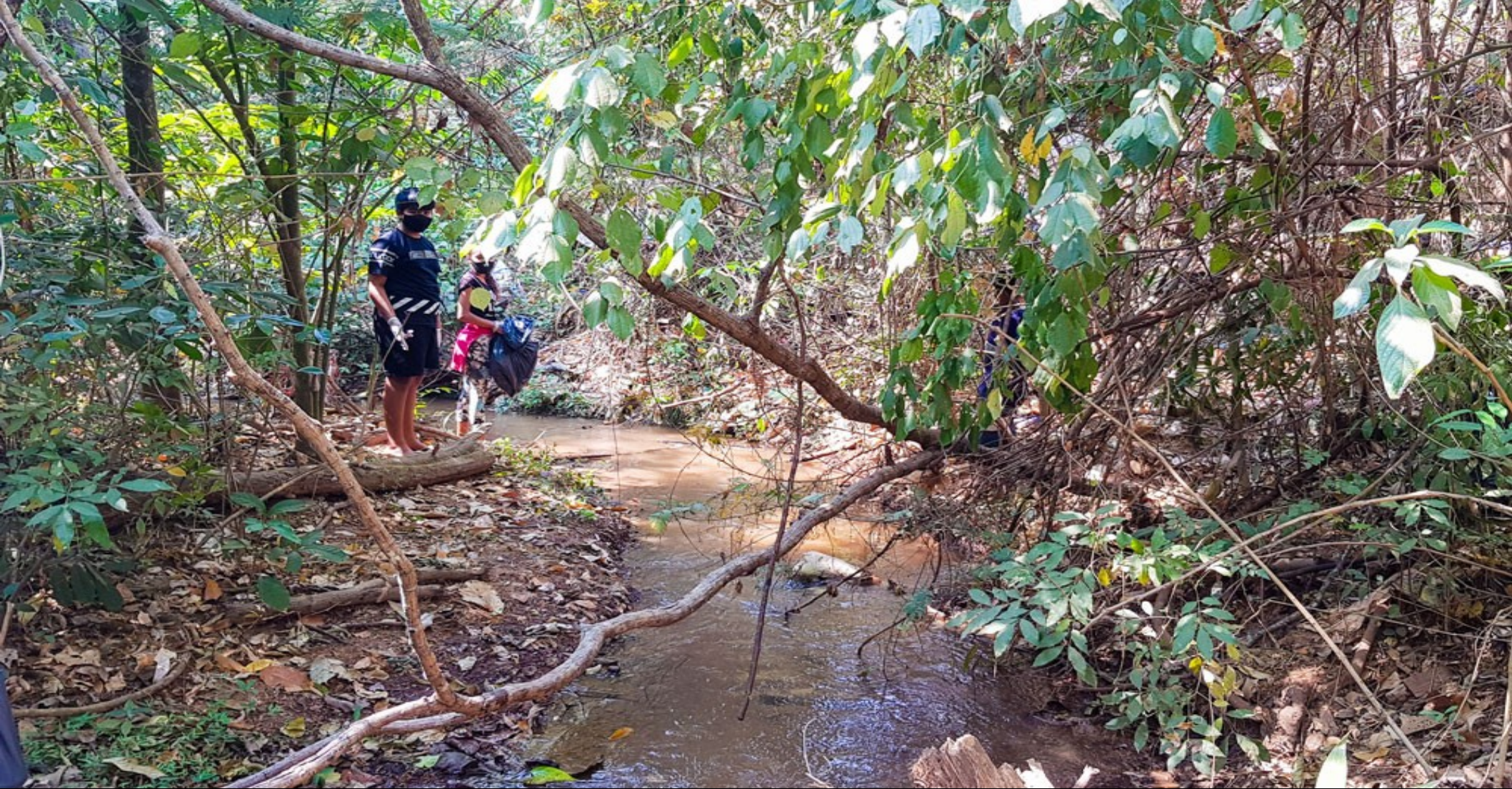
Brazil junior youth service project river cleanup