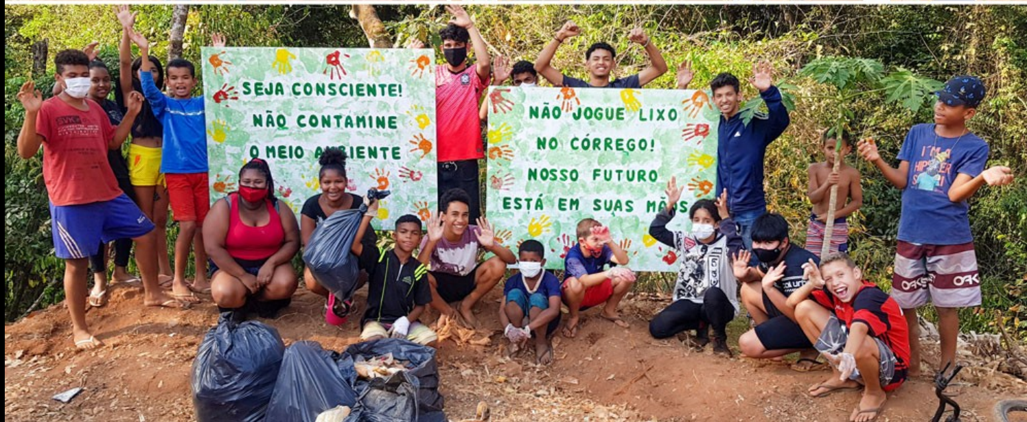
Brazil junior youth service project river cleanup