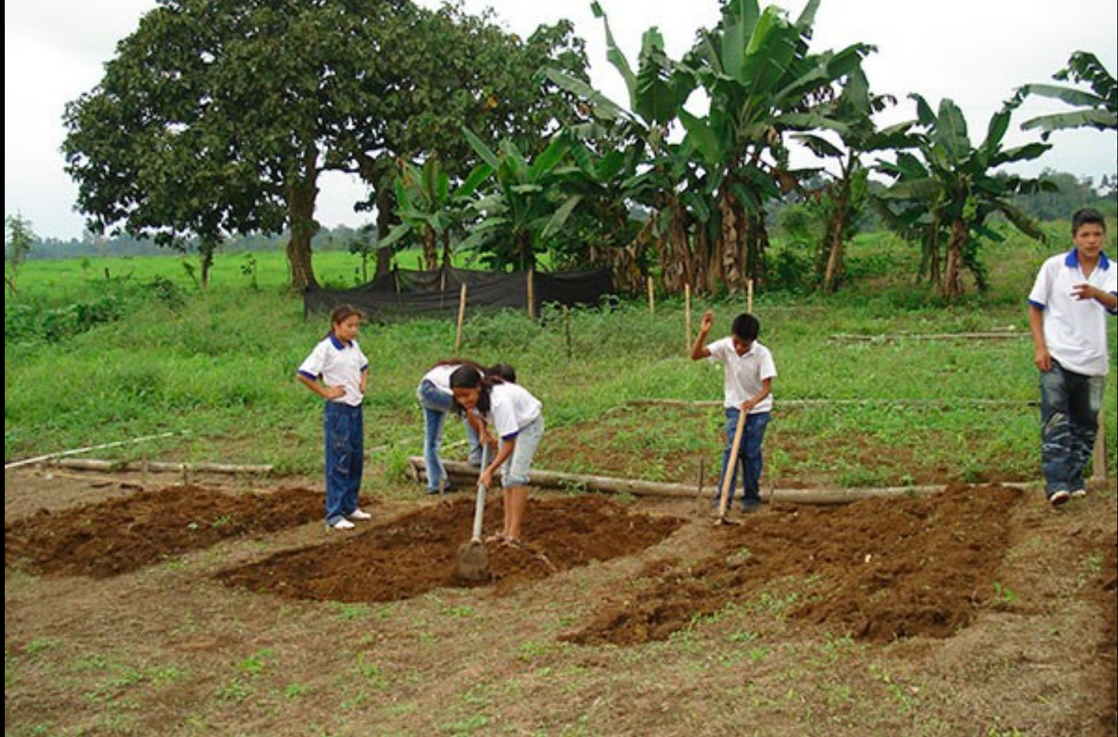
FUNDAEC service project learning community gardening