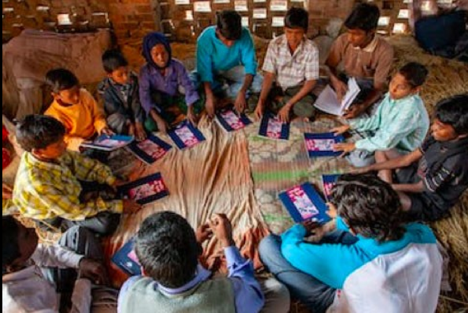
Junior youth in India