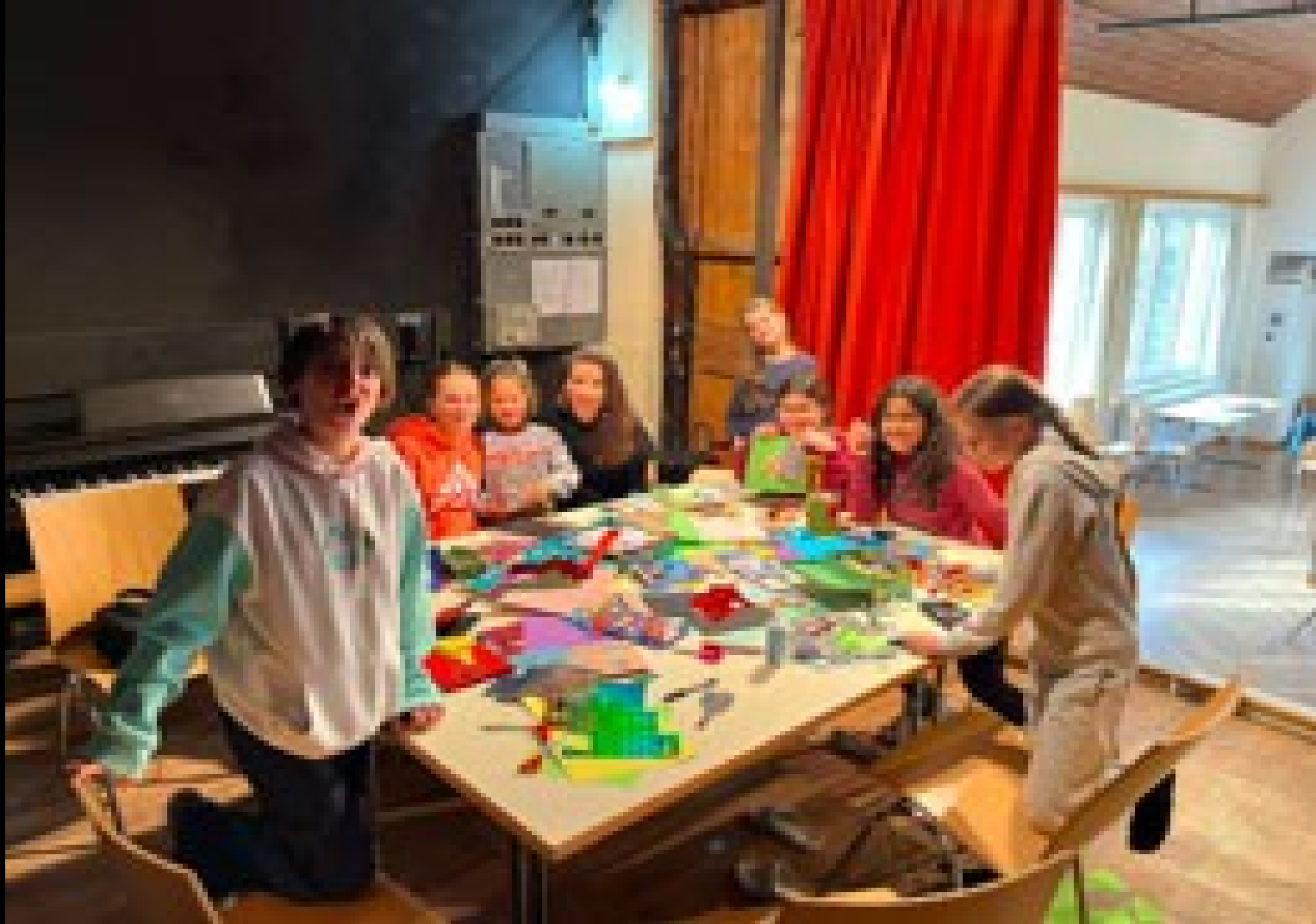
Junior youth in Switzerland