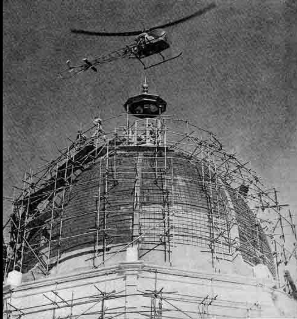
The aluminium lantern of the dome, weighing about 800 pounds, was lowered into position in two sections by helicopter on April 27, 1960.