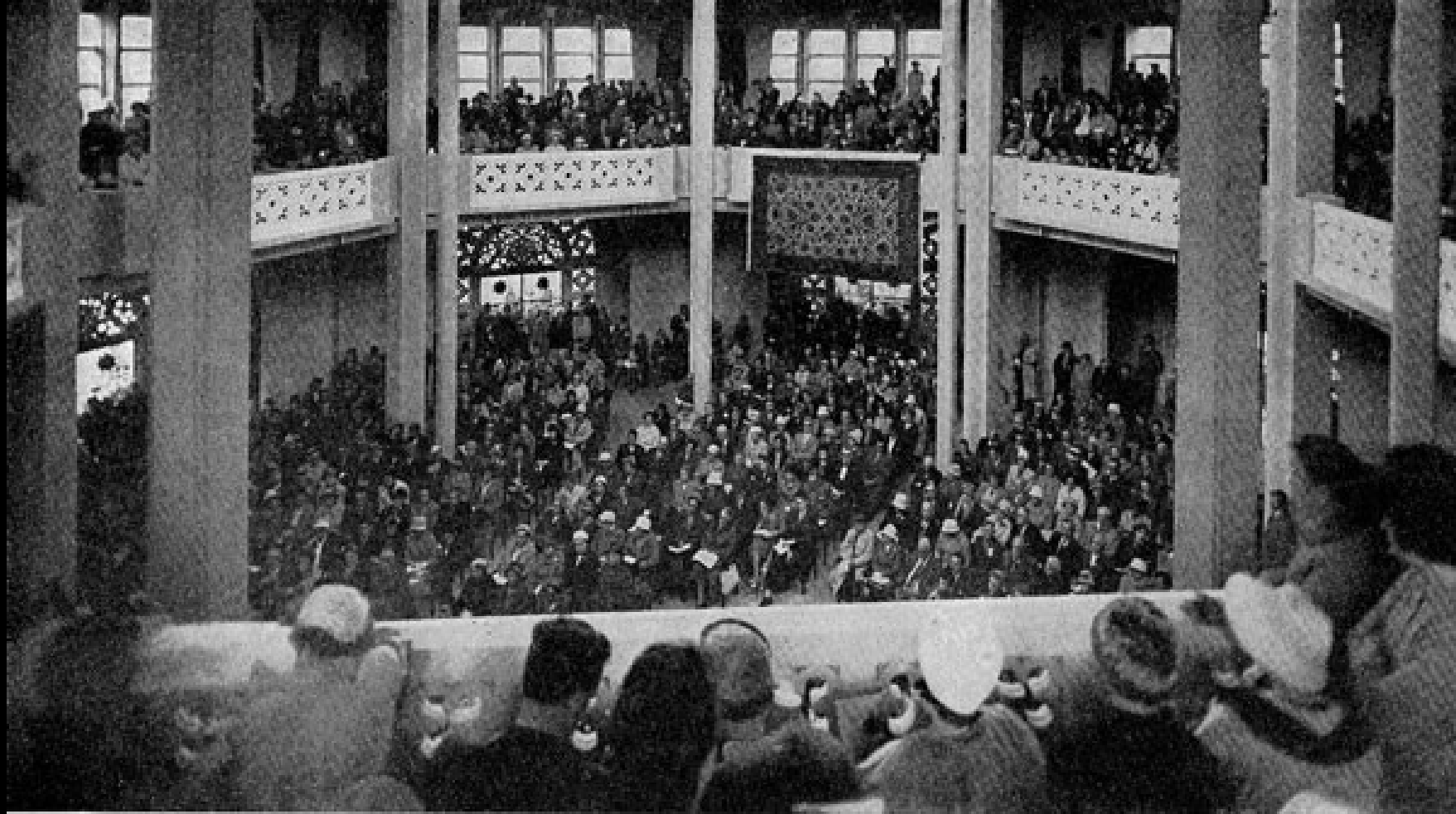
DEDICATION OF THE MOTHER TEMPLE OF THE PACIFIC September 16-17, 1961.