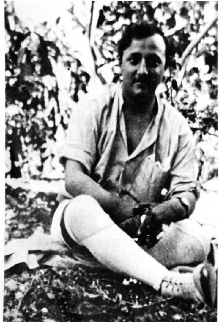
THE YOUNG SCHOLAR AT HIS EASE