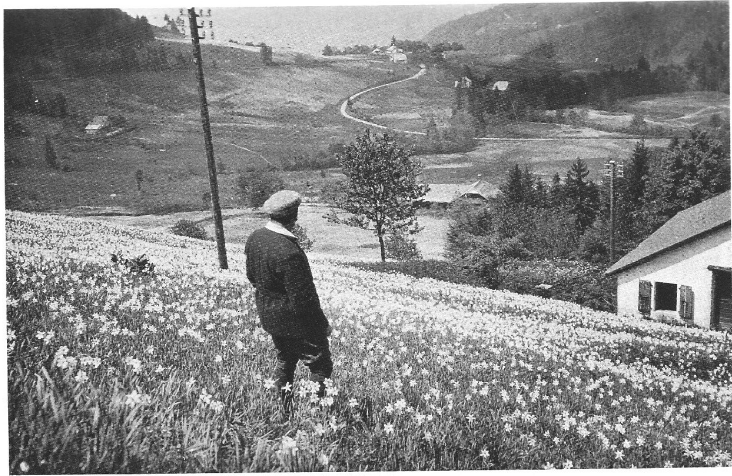
THE YOUNG GUARDIAN IN SWITZERLAND

Shoghi Effendi enjoying the famous springtime fields of wild narcissus flowers above Lac Léman