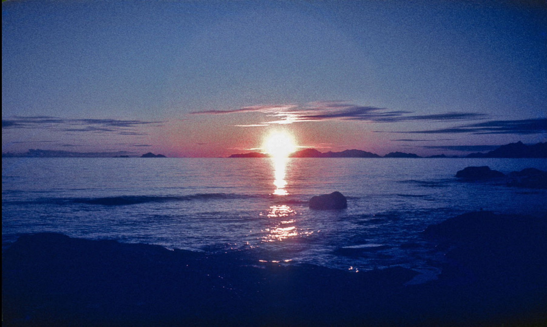
Lofoten Islands – midnight sun