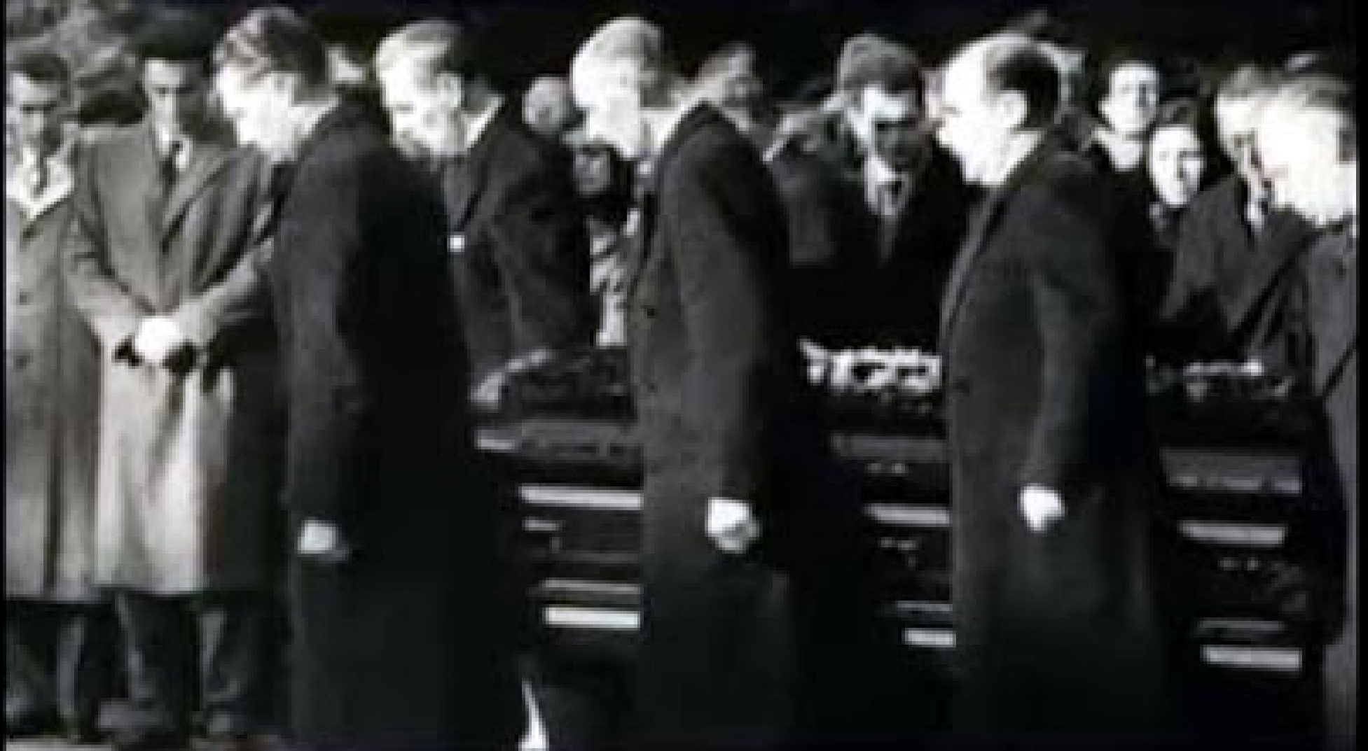
Funeral of Shoghi Effendi in London, November 1957