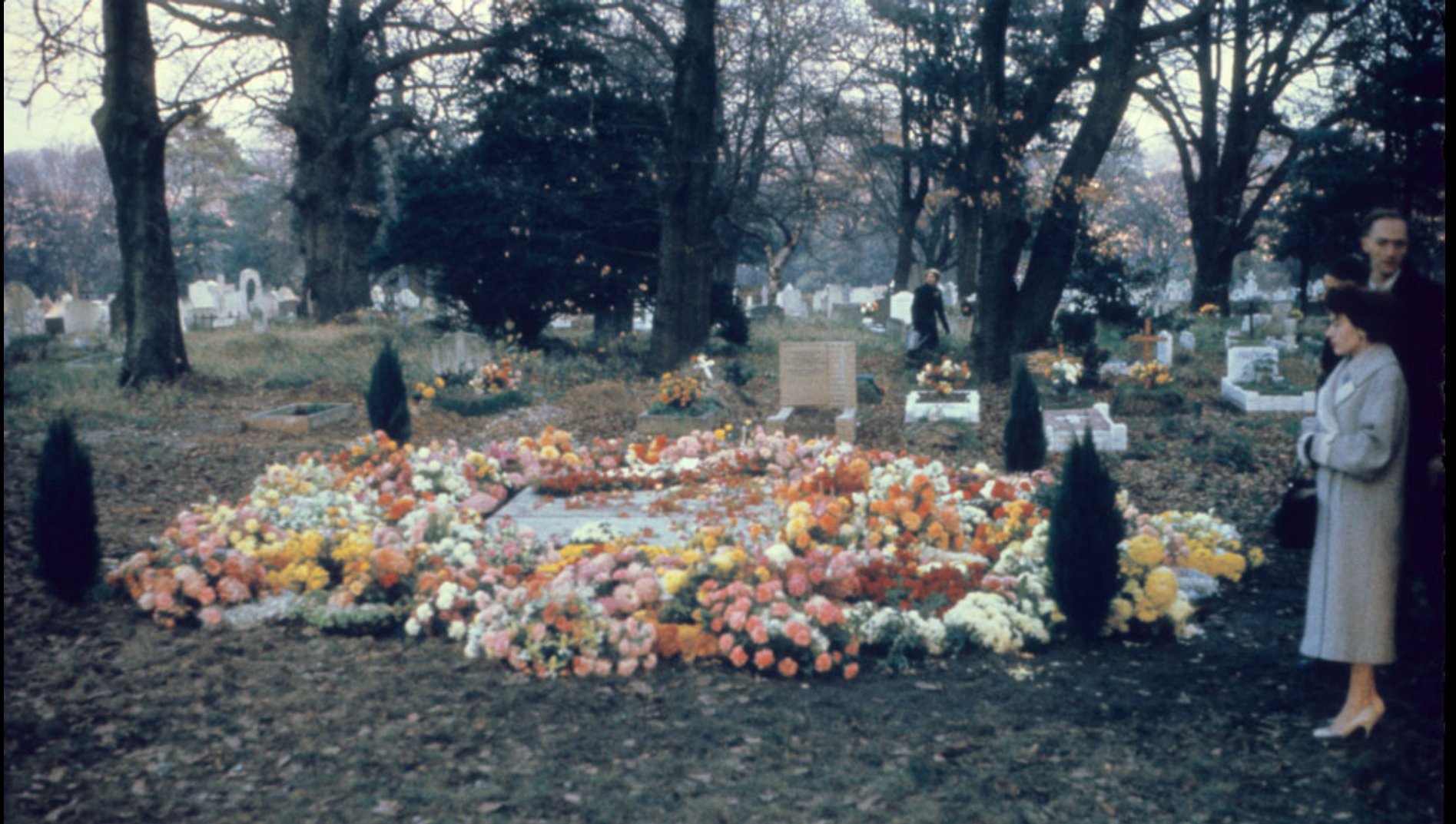
Funeral of Shoghi Effendi in London, November 1957