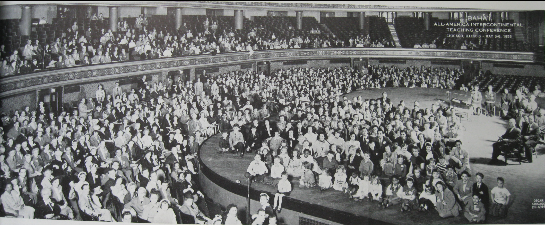
Bahá'í All-America Intercontinental Teaching Conference, Chicago, Illinois, May 3-6, 1953.