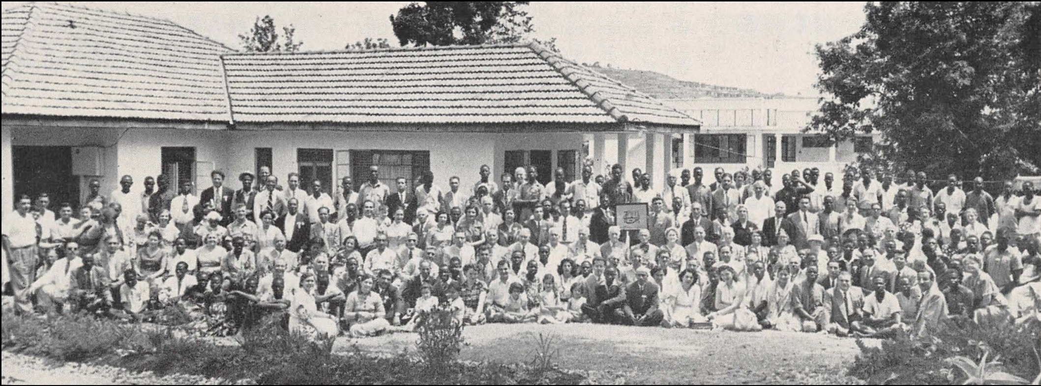
African Teaching Conference, Kampala 1953