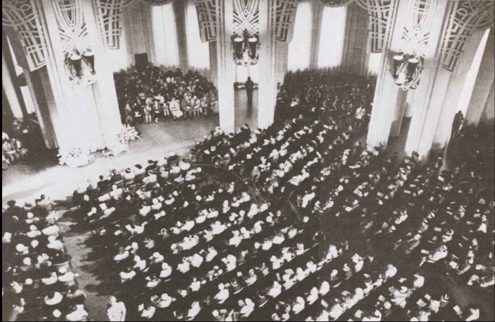
Dedication of Bahá'í Temple, Wilmette, USA 1953