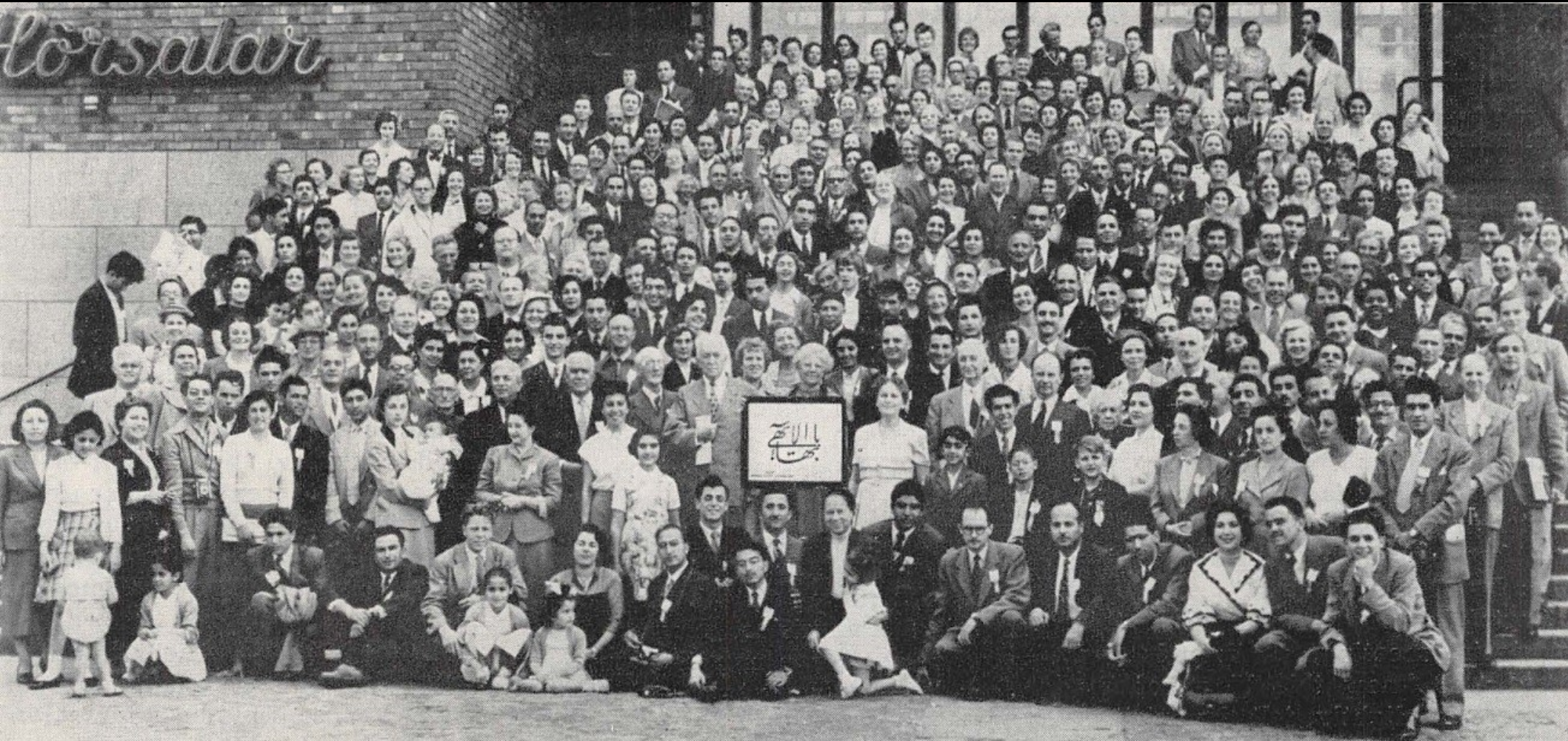
European Teaching Conference, Stockholm 1953