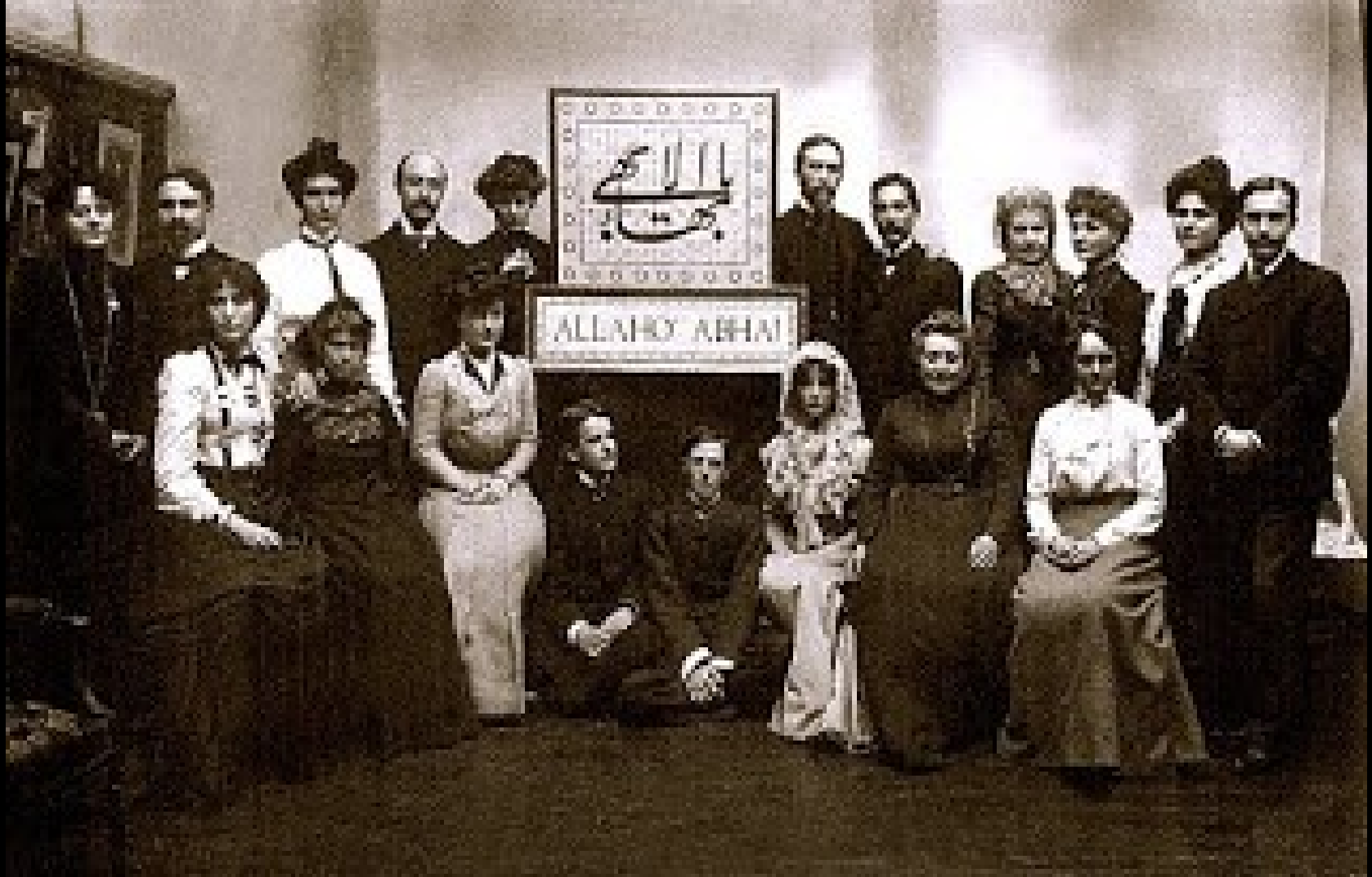
Paris group 1901