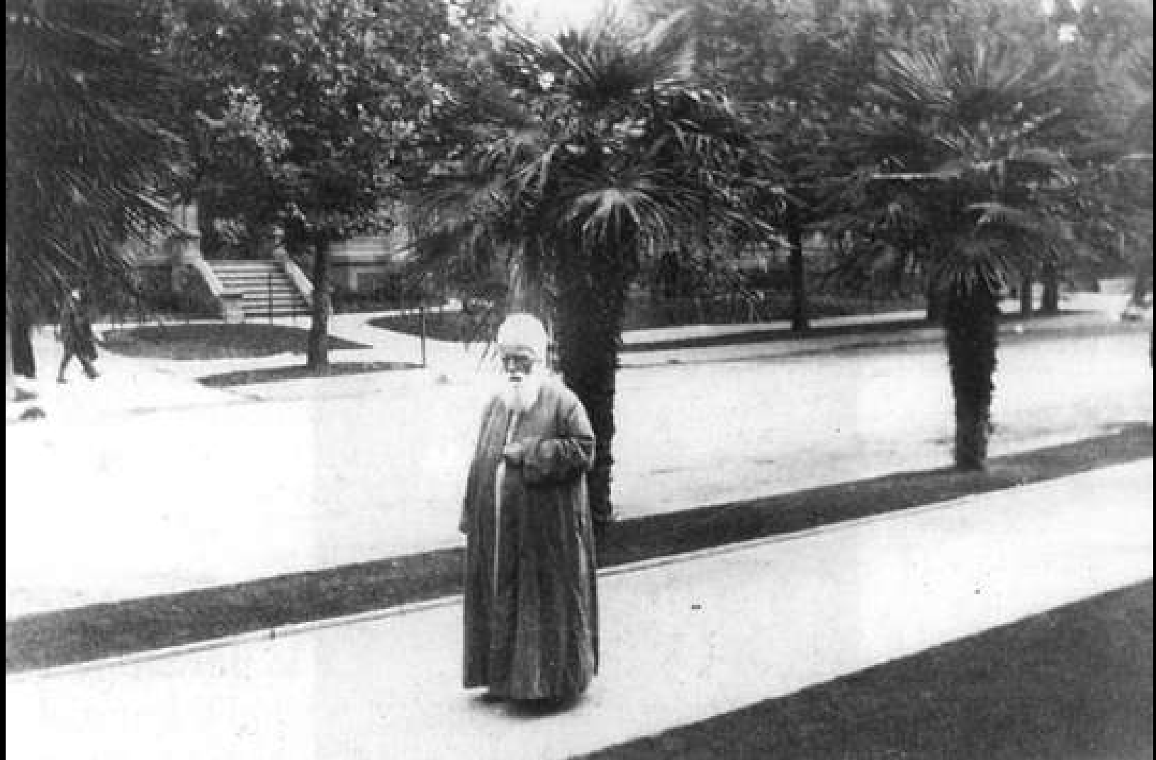
'Abdu'l-Bahá in Oakland