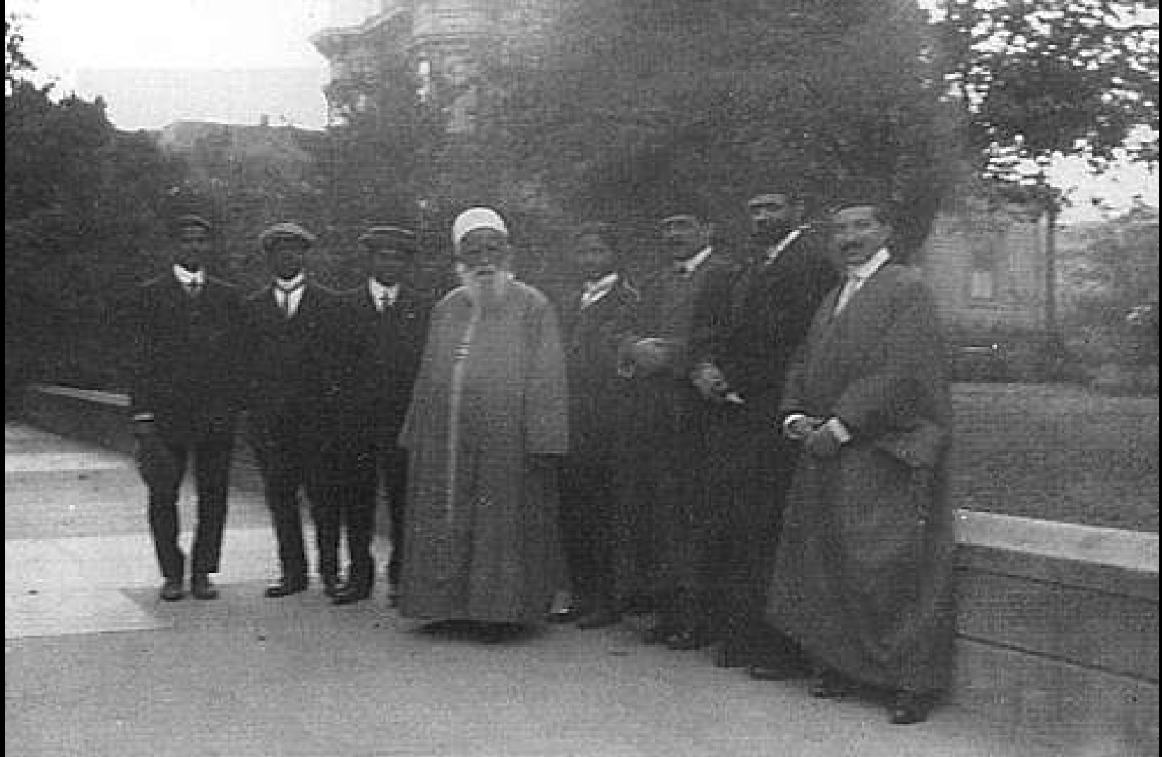
'Abdu'l-Bahá in California