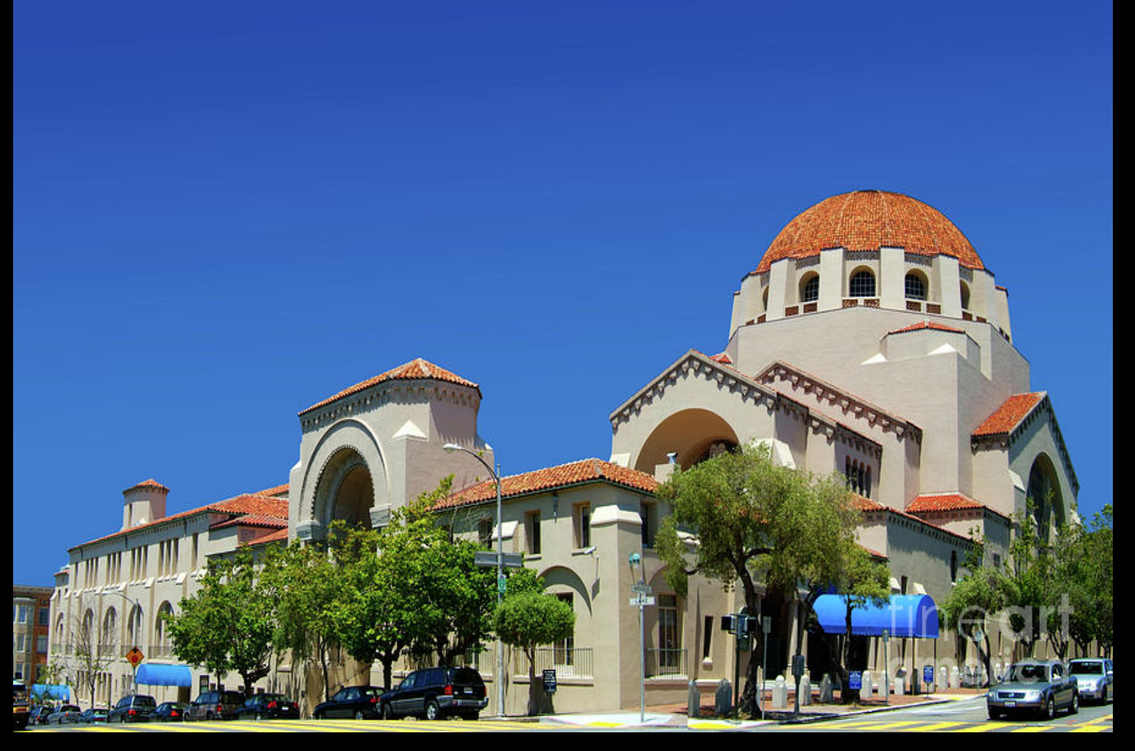
Temple Emanu-El, San Francisco