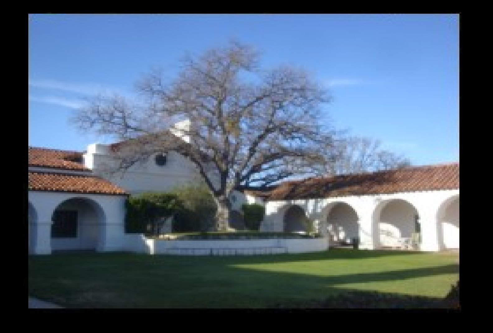
Hearst hacienda near Pleasanton, California