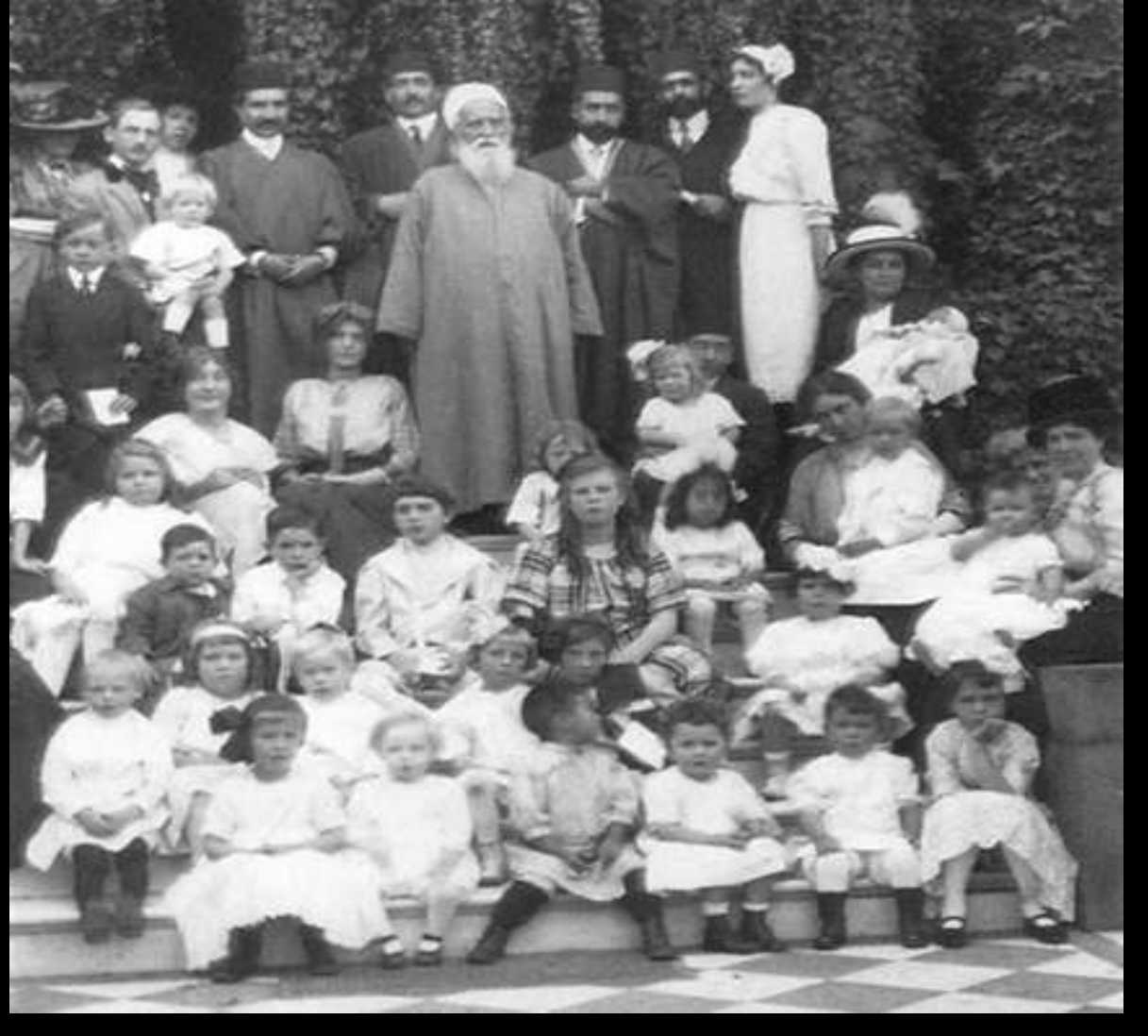
'Abdu'l-Bahá with children at Goodall home