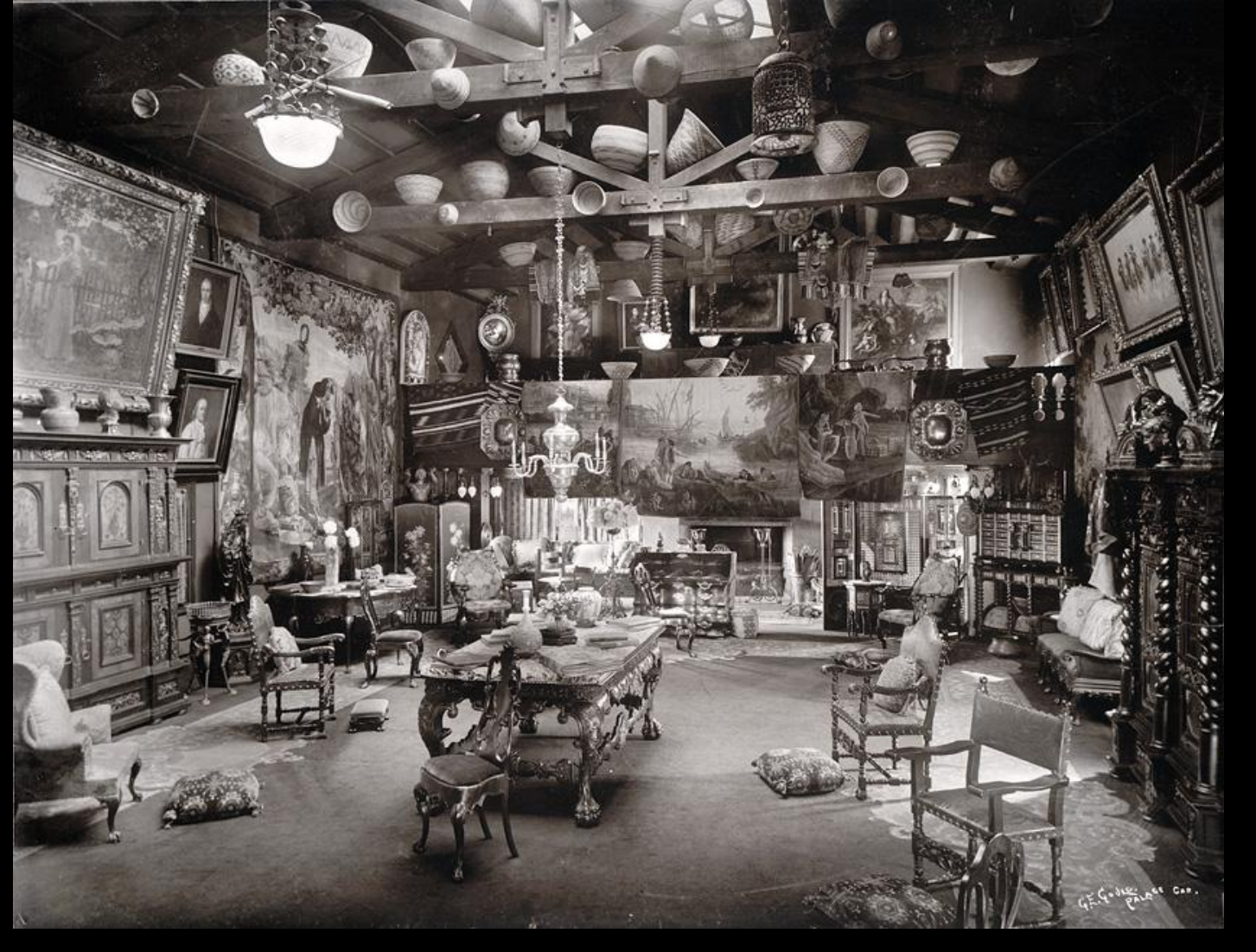
Hearst hacienda near Pleasanton, California