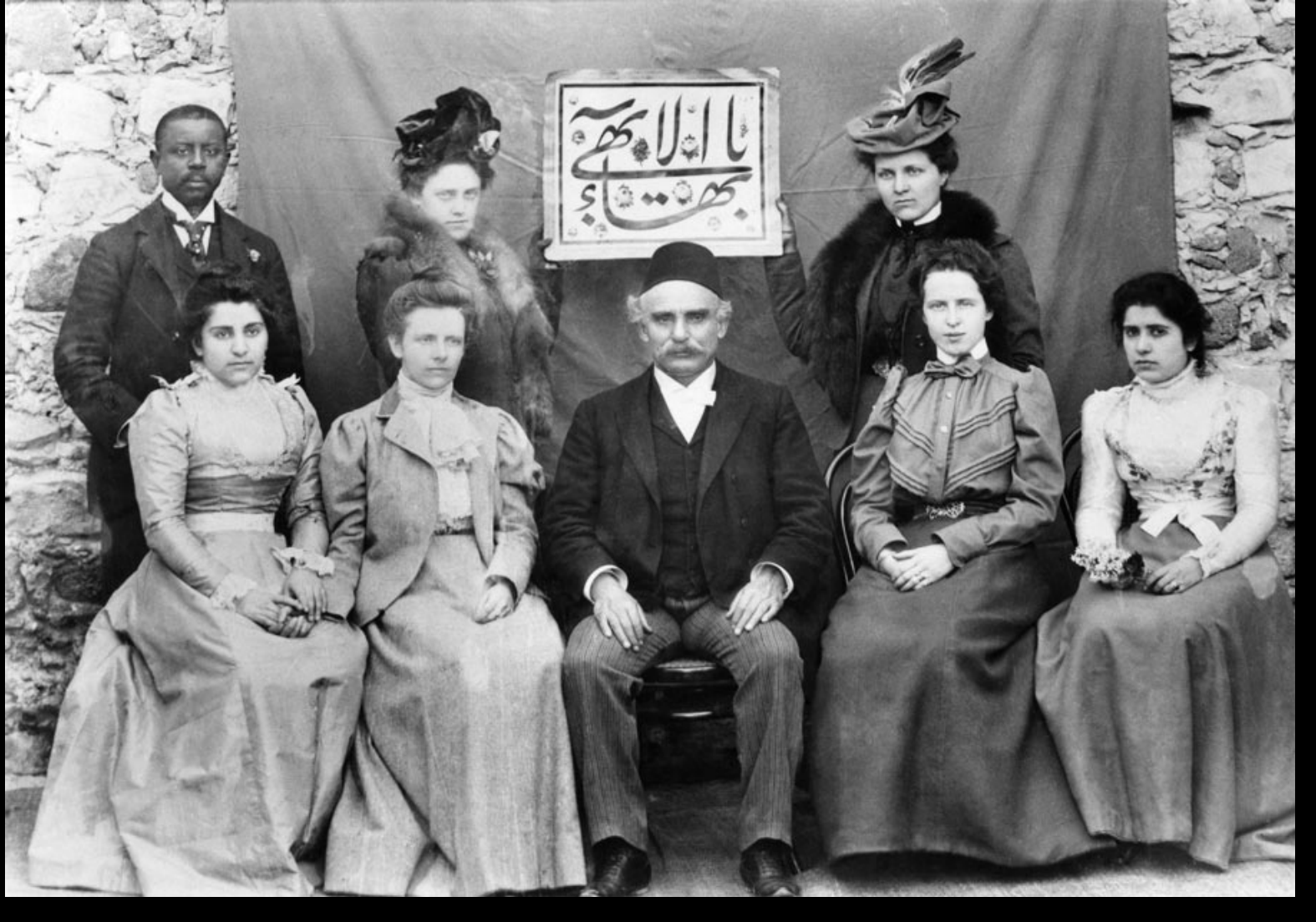
The first Western pilgrimage 1898