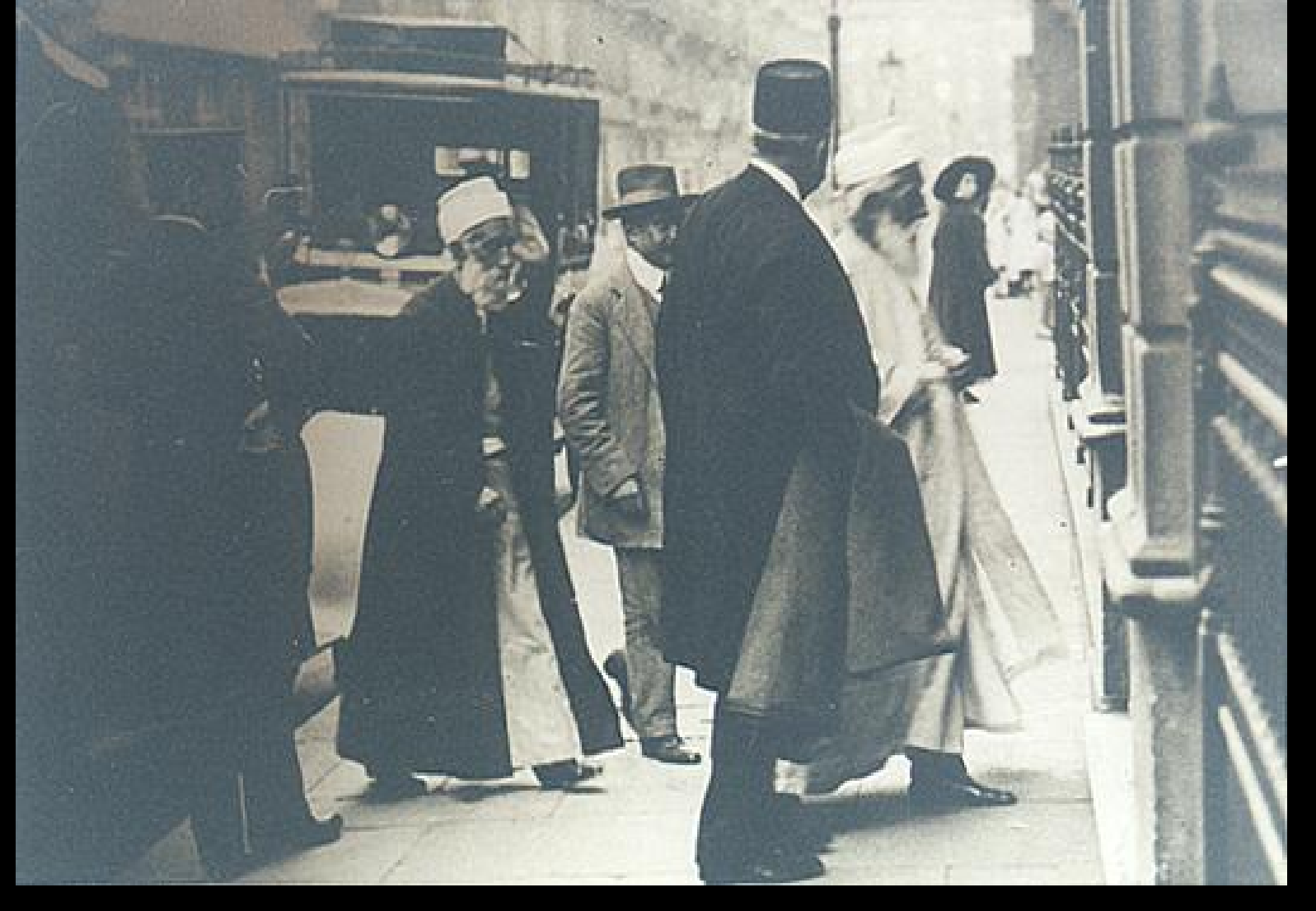
'Abdu'l-Bahá in London