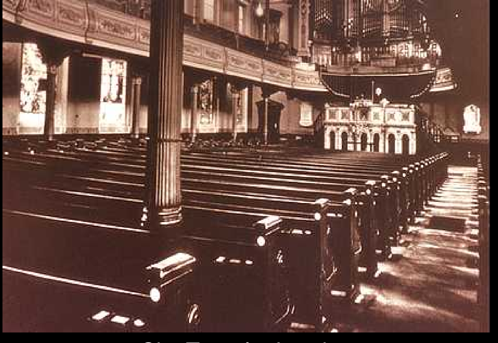
City Temple, London