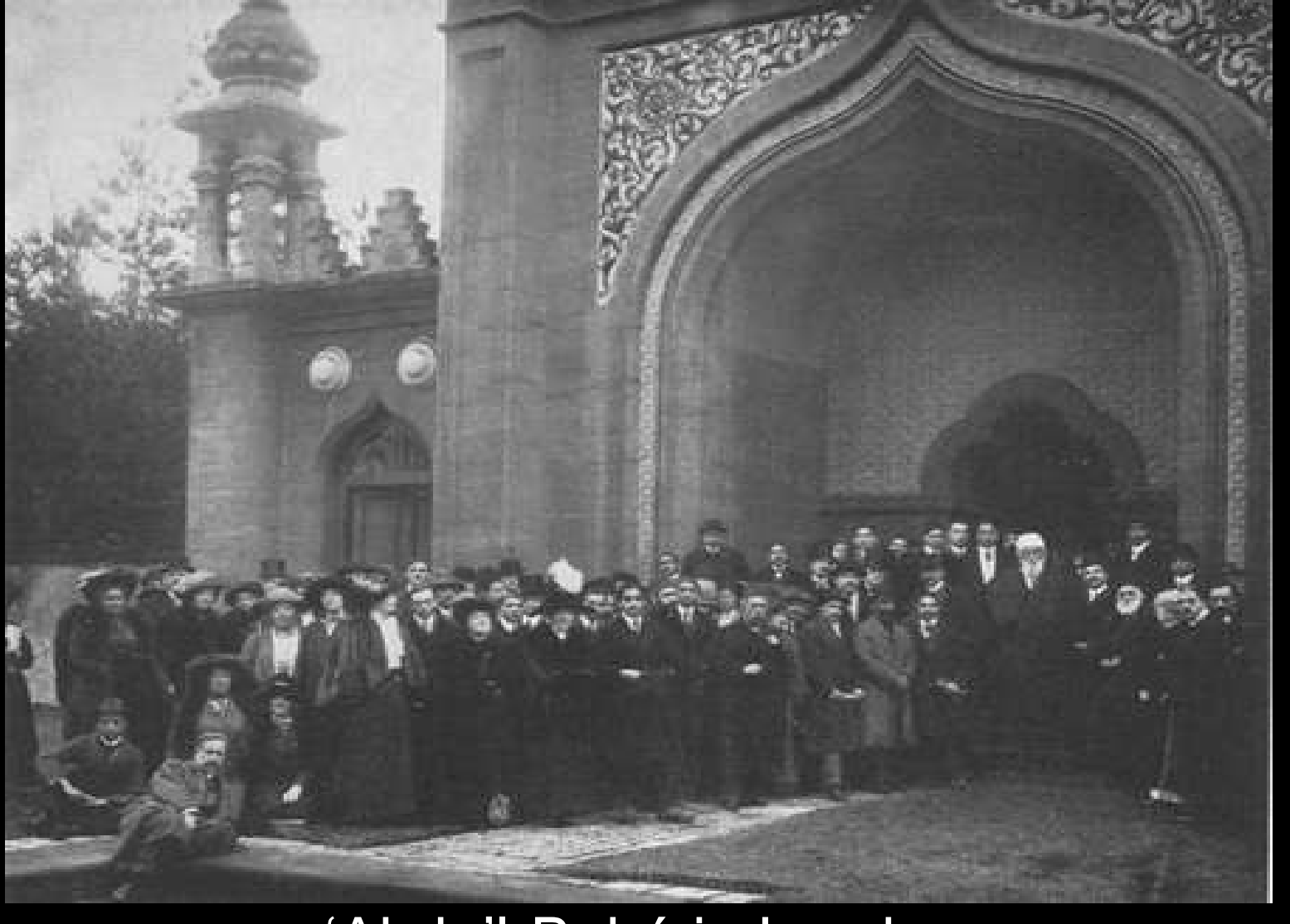
'Abdu'l-Bahá in London