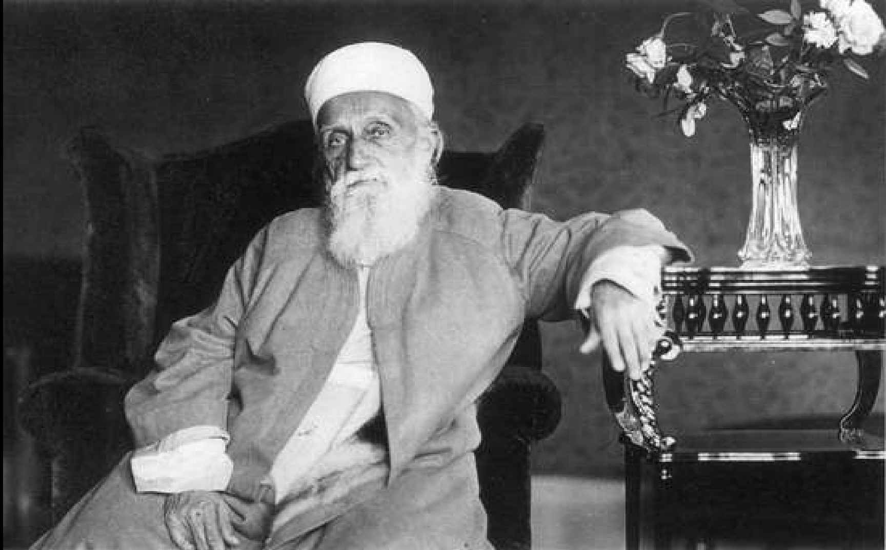
'Abdu'l-Bahá in Philadelphia 1912