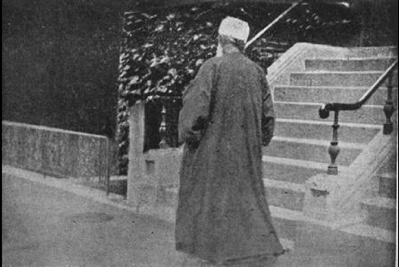
'Abdu'l-Bahá in New York 1912