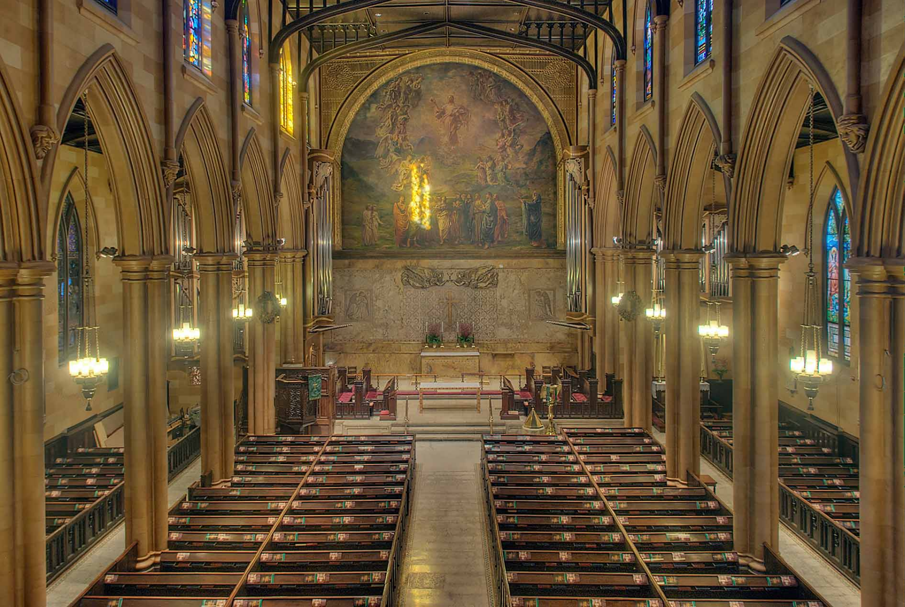
Church of the Ascension New York