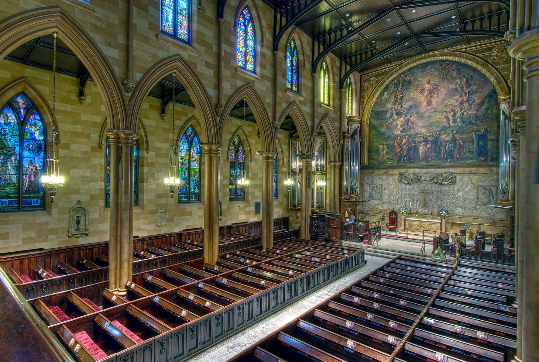
Church of the Ascension New York