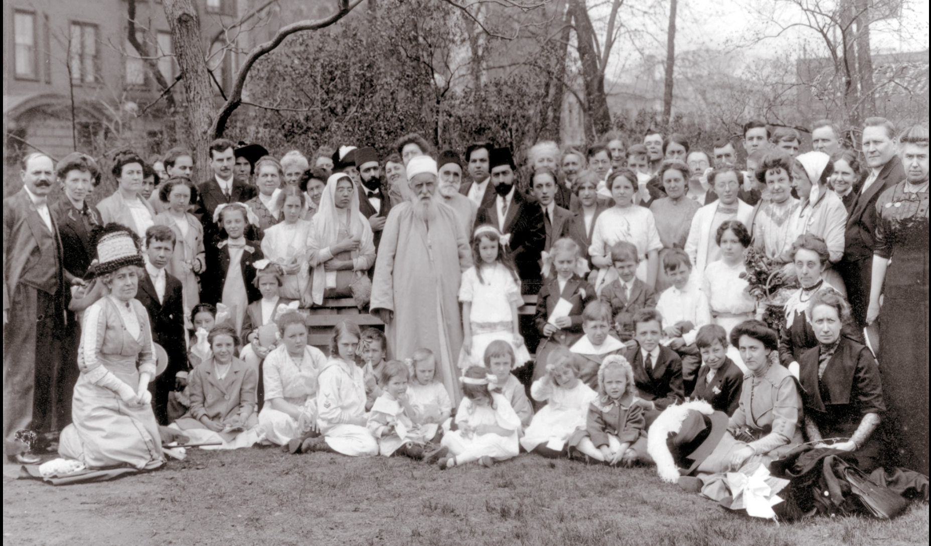
Lincoln Park, Chicago, 1912