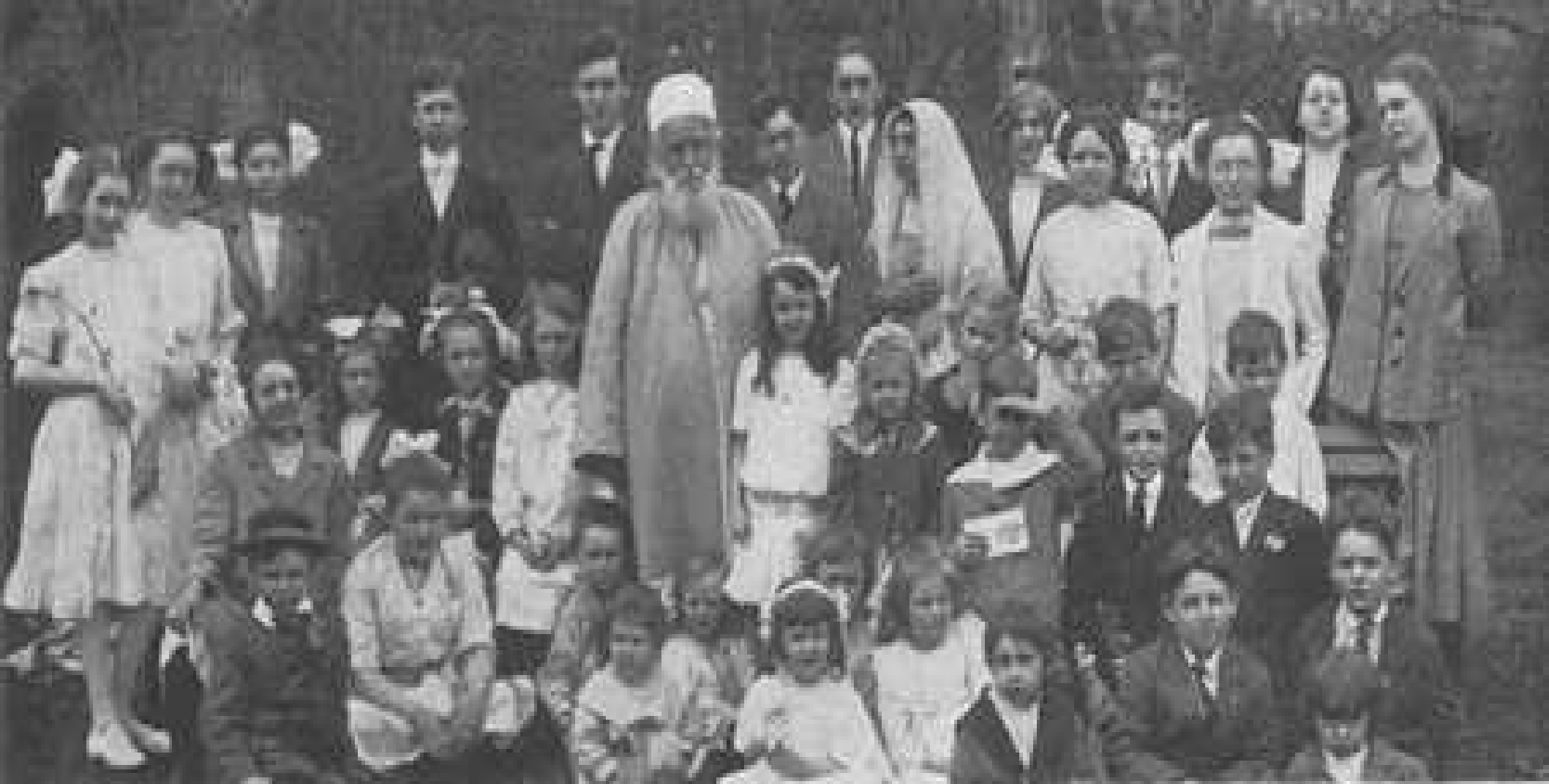
With children in Lincoln Park, Chicago, 1912