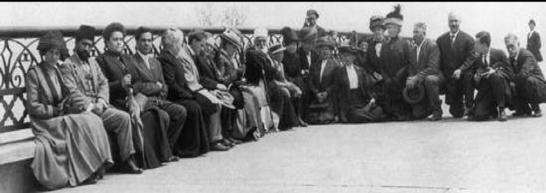
Lincoln Park, Chicago, 1912