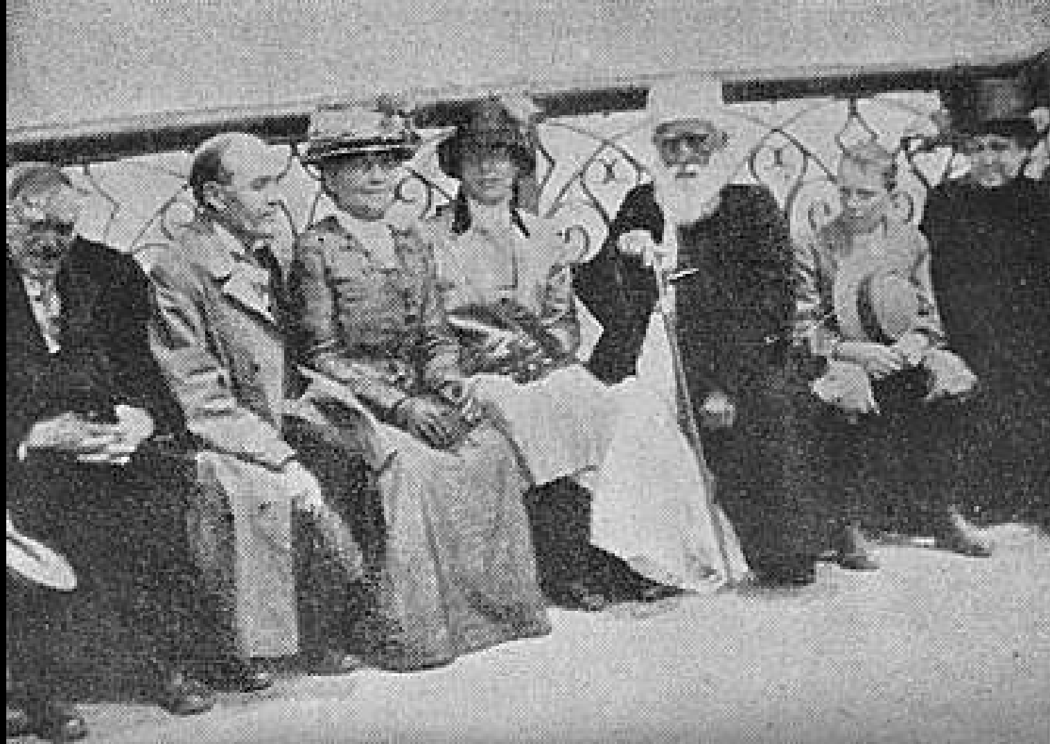
Lincoln Park, Chicago, 1912