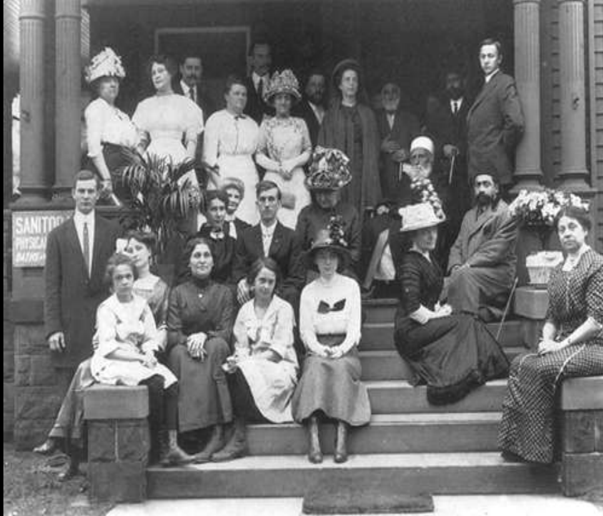
'Abdu'l-Bahá in Cleveland, Ohio, 1912