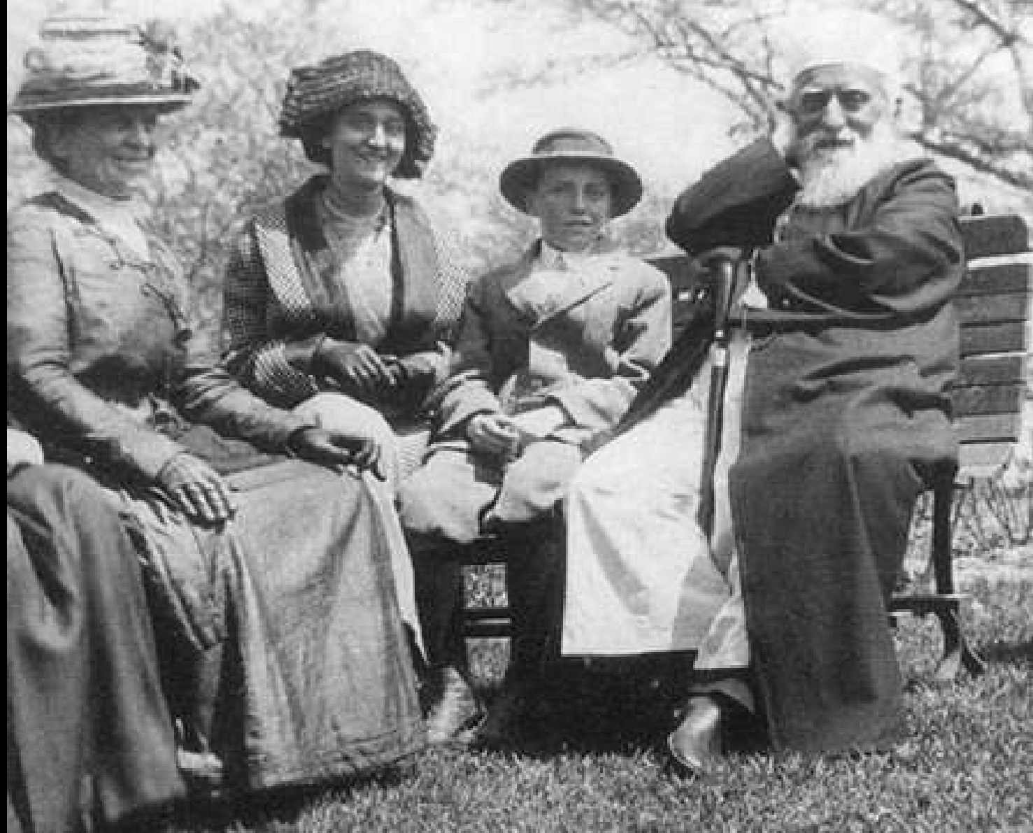
Lincoln Park, Chicago, 1912