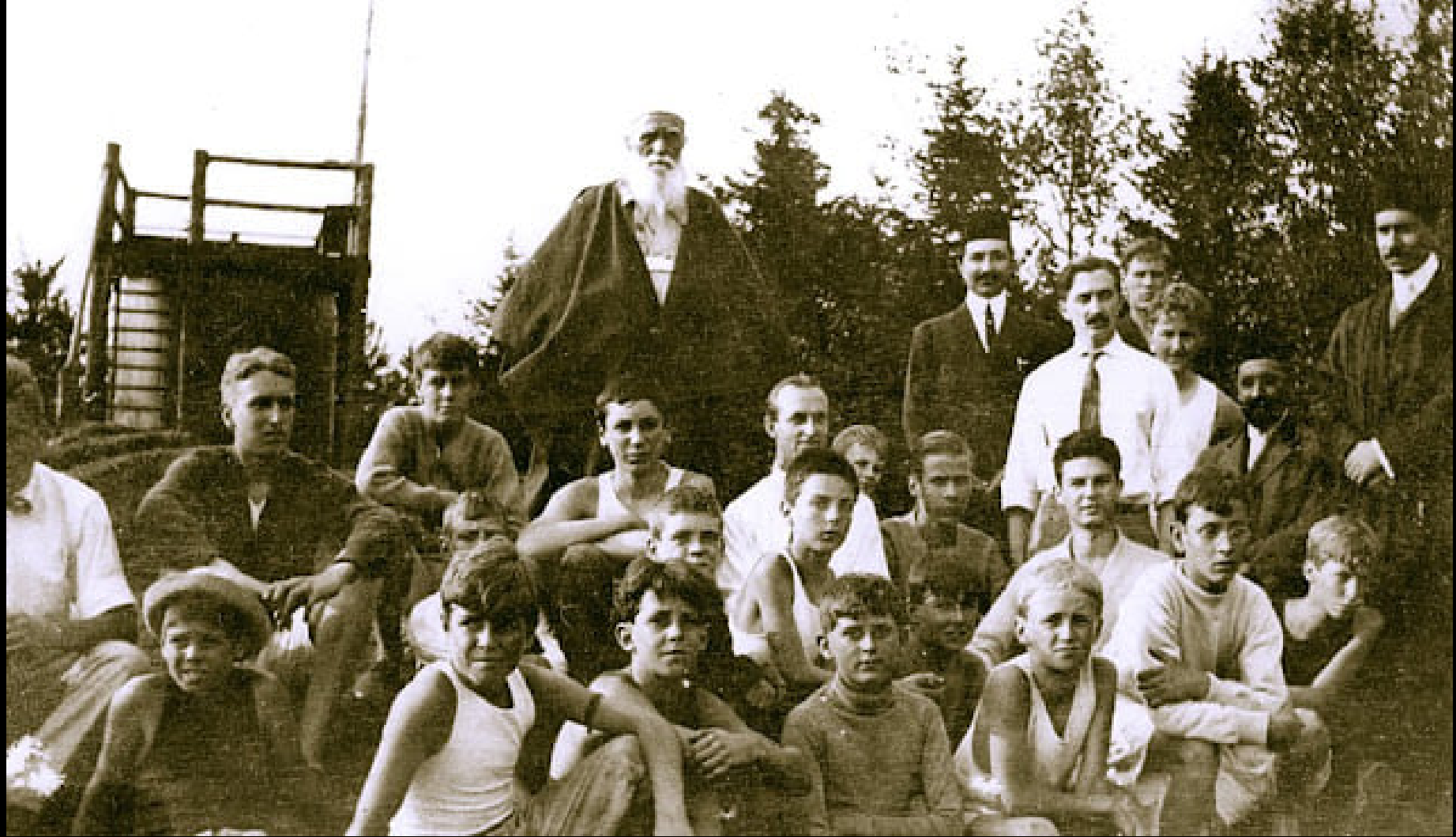
'Abdu'l-Bahá in Cleveland, Ohio, 1912